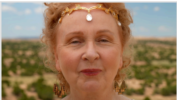
Kate Burton as “Sarah Bernhardt”

Rosemary is an inductee into the American Theater Hall of Fame. She is a four-time Drama Desk Award winner and nine-time Tony Award nominee, winning the Tony Award for Best Actress in a Play for “ The Lion in Winter ”. She won the Primetime Emmy Award for Outstanding Lead Actress in a Limited Series or Movie for the BBC serial “ Notorious Woman ”, and the Golden Globe Award for Best Actress – Television Series Drama for the miniseries “ Holocaust ” (1978). She is also known for Aunt May in Spider-Man (1, 2, 3) . Rosemary received multiple nominations for her performance in “ Tom & Viv ”, including the Academy Award for Best Supporting Actress .