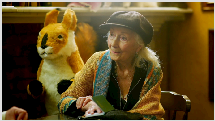
Rosemary Harris as “Lady Bracknell”