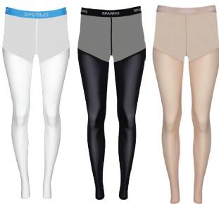
SP WOMEN'S LEGGINGS