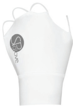
UNISEX SP GLOVE