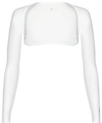
UNISEX SP SHOULDER WRAP (PLAIN LOGO)