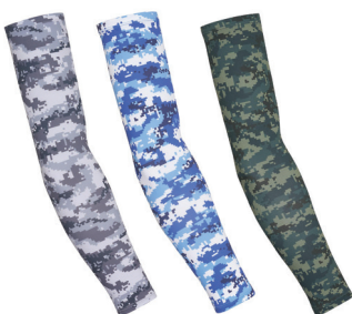
UNISEX SP SUN SLEEVES (DIGITAL CAMO)