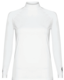
SP FULL BODY WOMEN'S HIGH NECK