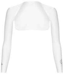
UNISEX SP SHOULDER WRAP (CRYSTAL LOGO)