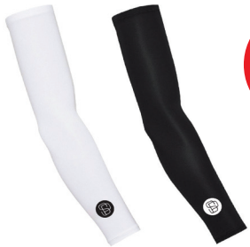
UNISEX THERMOTECH SLEEVES