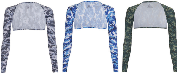
UNISEX SP SHOULDER WRAP (DIGITAL CAMO)