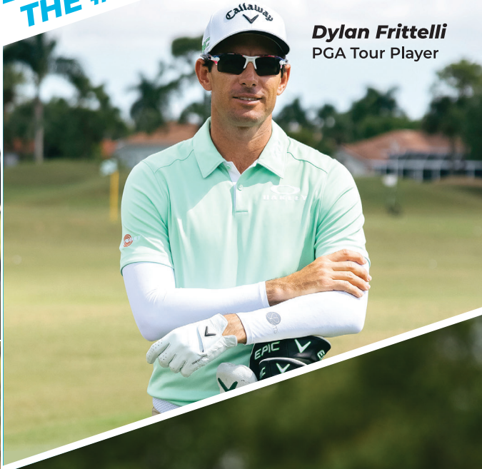
Dylan Frittelli PGA Tour Player