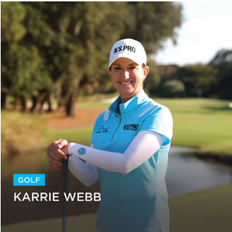
GOLF KARRIE WEBB