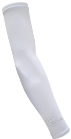
UNISEX SP SUN SLEEVES (CRYSTAL LOGO)