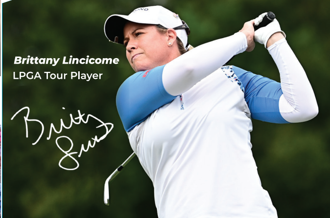
Brittany Lincicome LPGA Tour Player