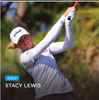
GOLF STACY LEWIS