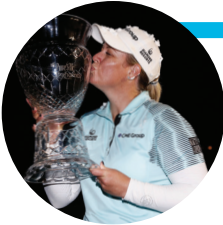
Brittany Lincicome Professional Golfer (LPGA) LPGA Tour Winner

“SParms has been an amazing addition to my golf game and has become something I really believe in and love advocating for. Their team has created such an intelligent and valuable product for both men and women. The wraps are my favorite – they protect my skin so that I can focus on my game. When wearing sleeves in the sun, their design works to keep me cool. It has become an essential part of my golf attire, and I am quite thankful for the impact it has on my career and health”