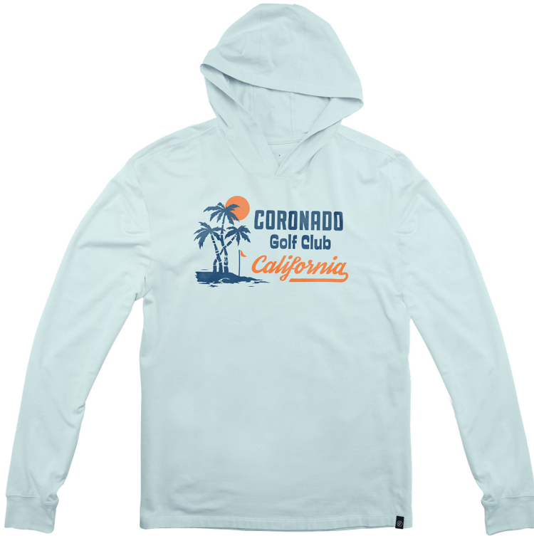
10200H The Après Hoodie

Mens' short sleeve crew neck • Athletic fit • Sizes: S - 3XL 97% combed ring-spun cotton 44 singles, 7% spandex 44 singles long staple cotton for buttery softness 5.0 oz. • Set in 1x1 ribbed knit collar Rolled shoulders and double needle sewing at seams Pictured: Ice Blue