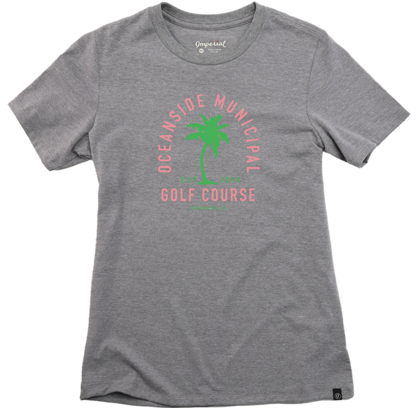
20200 The Après Ladies

Mens' long sleeve crew neck • Athletic fit • Sizes: S - 3XL 97% combed ring-spun cotton 44 singles, 7% spandex 44 singles long staple cotton for buttery softness 5.0 oz. • Set in 1x1 ribbed knit collar Rolled shoulders and double needle sewing at seams Pictured: forest green / *Check new color availability