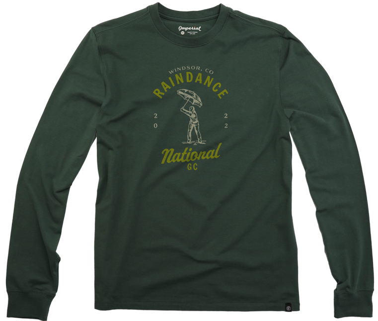
10200L The Après Long Sleeve

Mens' short sleeve crew neck • Athletic fit • Sizes: S – 3XL 97% combed ring-spun cotton 44 singles, 7% spandex 44 singles long staple cotton for buttery softness 5.0 oz. • Set in 1x1 ribbed knit collar Rolled shoulders and double needle sewing at seams Pictured: midnight navy / *Check new color availability