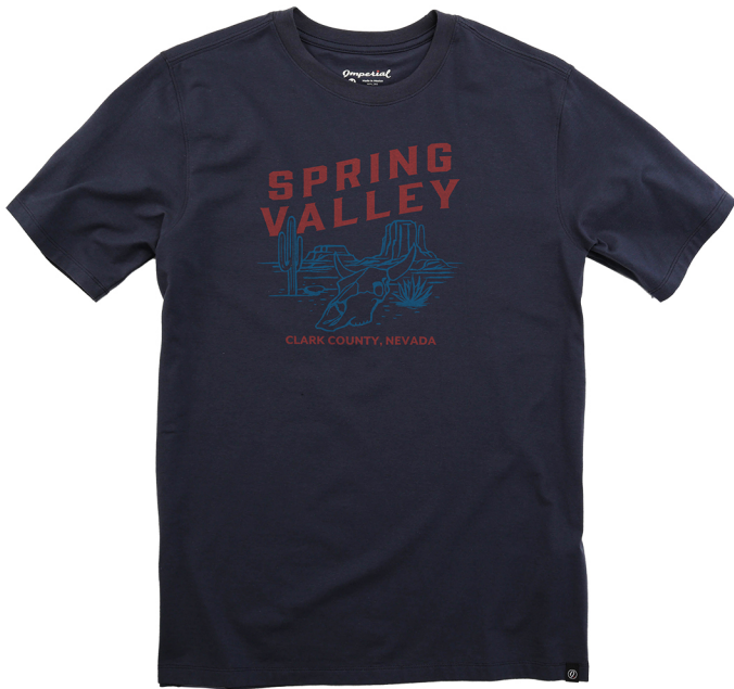
10200 The Après Tee

Mens' short sleeve crew neck • Athletic fit • Sizes: S – 3XL 97% combed ring-spun cotton 44 singles, 7% spandex 44 singles long staple cotton for buttery softness 5.0 oz. • Set in 1x1 ribbed knit collar Rolled shoulders and double needle sewing at seams Pictured: midnight navy / *Check new color availability