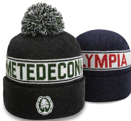
5300H The Sideliner Heathered

3" Cuff • Heathered yarn version of our best selling 5300