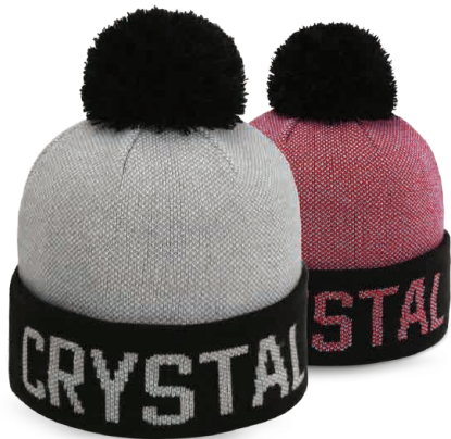
5307 The Zermatt

Soft 12 gauge acrylic yarns with fleece liner • One size fits most • Can be ordered with or without the pom