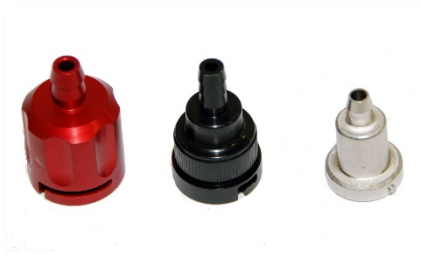
Figure 1 Select brand-specific adaptor (Olympus, Pentax, Fujinon shown here)