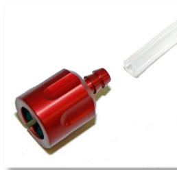
Figure 3 Insert barb from selected fitting into silicone tubing