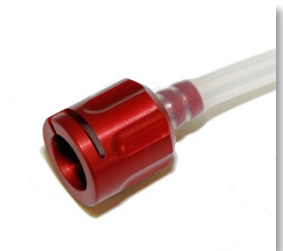
Figure 3B Assembly complete