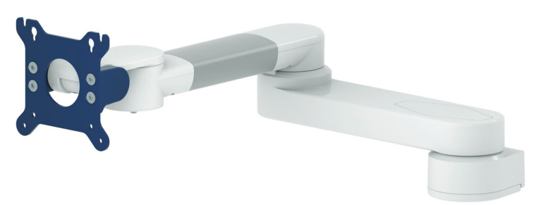
Extended pivot arm heavy duty