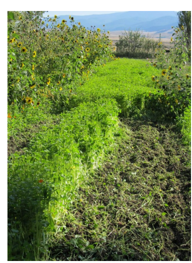
Buckwheat used as a cover crop