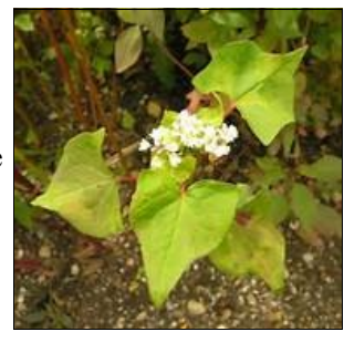
Fagopyrum esculentum Buckwheat

planted in the fall can produce enough biomass that will provide cover for the soil over