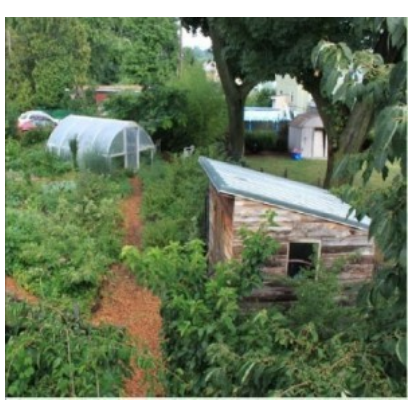
10-year-old edible forest garden in Holyoke, MA. Jonathan Bates.

What is an edible forest garden? It's a garden that mimics a woodland or forest ecosystem but substitutes mostly edible trees, shrubs, perennials and annuals. Fruit and nut trees provide the upper (canopy) layer. Underneath the trees are berry shrubs and other edible plants. Companion plants are selected to attract bees and other beneficial insects, to repel pests, and to help improve the soil. For the 6<sup>th</sup> Ward garden, a list of possible trees includes European pear, dwarf and standard apple varieties, plum, hazelnut, and Nanking cherry. There is