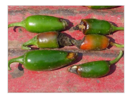
Blossom end rot of peppers

Although blossom end rot does not spread to other plants, remove and dispose of affected fruits, since secondary infections of bacteria or fungi may spread to other plants.