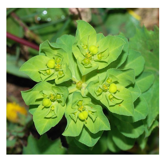
E. esula, Leafy Spurge

Controls: 2,4,D or Roundup can be applied in June or in early-mid September. However, they have a limited impact, and Roundup will kill all other plants, leaving the ground open to other weeds. Maintaining native species is an important deterrent to leafy spurge. Grazing sheep or goats, and using biological control has shown to be effective. Ultimately the most effective control of leafy spurge is an integrated combination of biological, chemical, and cultural practices.