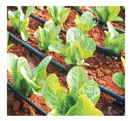
Drip irrigation in the garden

A much less expensive method is to use soaker hoses. Black soaker hoses are much like regular hoses and can be connected together. Weave them through and around the plants in your beds. Find them at any garden center.