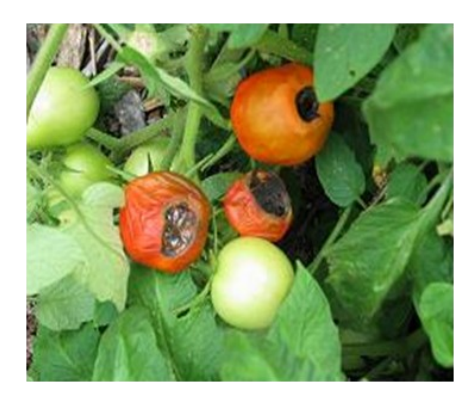
Blossom end rot of tomatoes