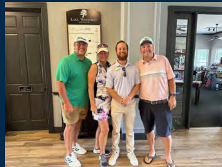
4 th Place