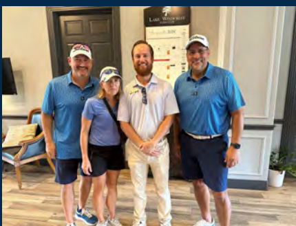
5 th Place