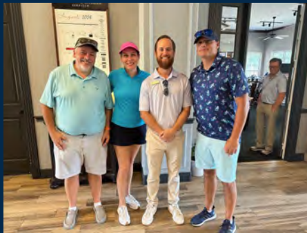
3 rd Place