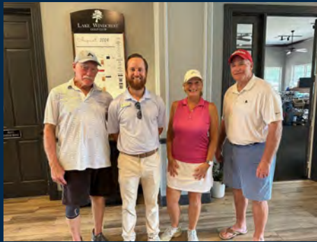
1 st Place