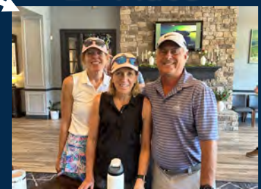
3 rd Place