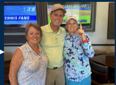
1 st Place