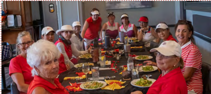
Southwest Salad was delightful!