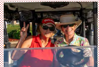
We're ready...let's go!