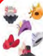
Derby Hat Contest

PLEASE INDICATE IF YOU PLAN TO ATTEND THE PAIRING PARTY IN THE COMMENTS SECTION AT SIGNUP.COM