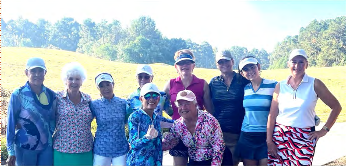
HAIL, HAIL... THE GANG'S ALL HERE... AND READY FOR THE LADIES CLUB CHAMPINSHIP!