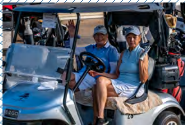
WE'RE READY...LET'S GO!