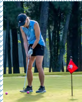
TIME FOR PRACTICE