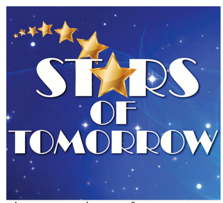
Please join us at the Stars of Tomorrow Concert

In summary- enjoy the happy endings and a great new year, too!