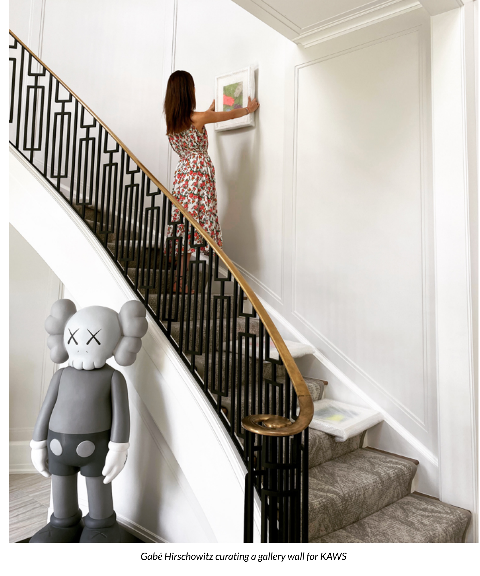
1. The Only Sure Rule Is There Are No Rules

Beyond planning out the mood of the room where your new purchase will live, it's also a good idea to consider practicalities like dimensions. I recommend applying blue painter's tape to your wall or floor space to mark out exactly how much area a piece will take up-bearing in mind that framing may also be integral. Remember: online photographs can throw any eye off as to the size of a piece, so minding the noted dimensions is critical.