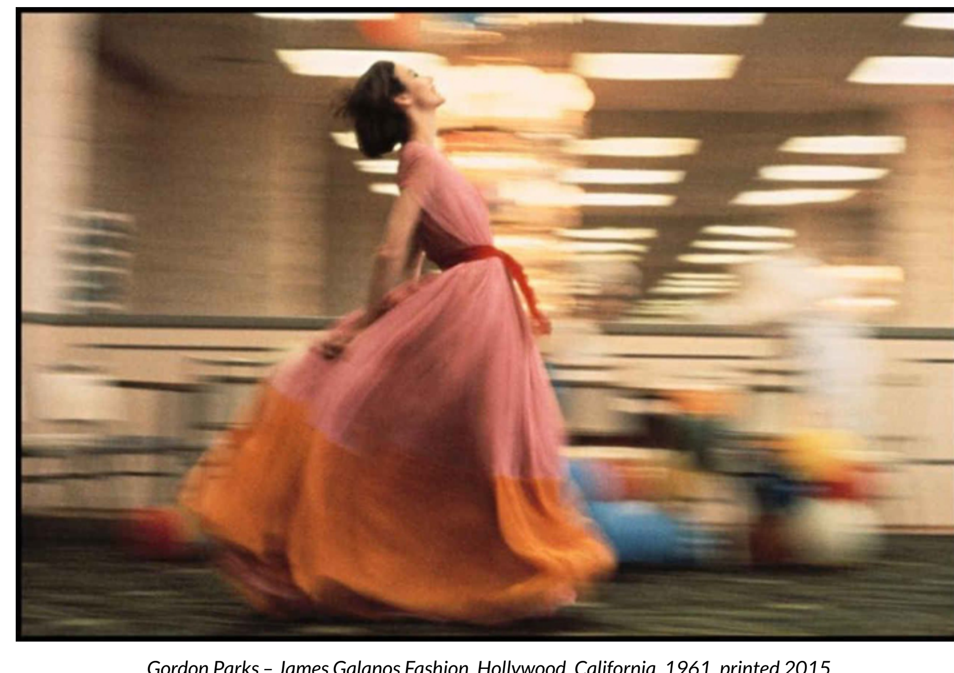
Gordon Parks – James Galanos Fashion, Hollywood, California, 1961, printed 2015

Think about the function of the space. Is it a room that you meditate in? Work in? Entertain or host dinner parties in? Choose a piece that reflects the mood and energy of the room. What design goals are you trying to achieve with this space? Plan this out before buying.