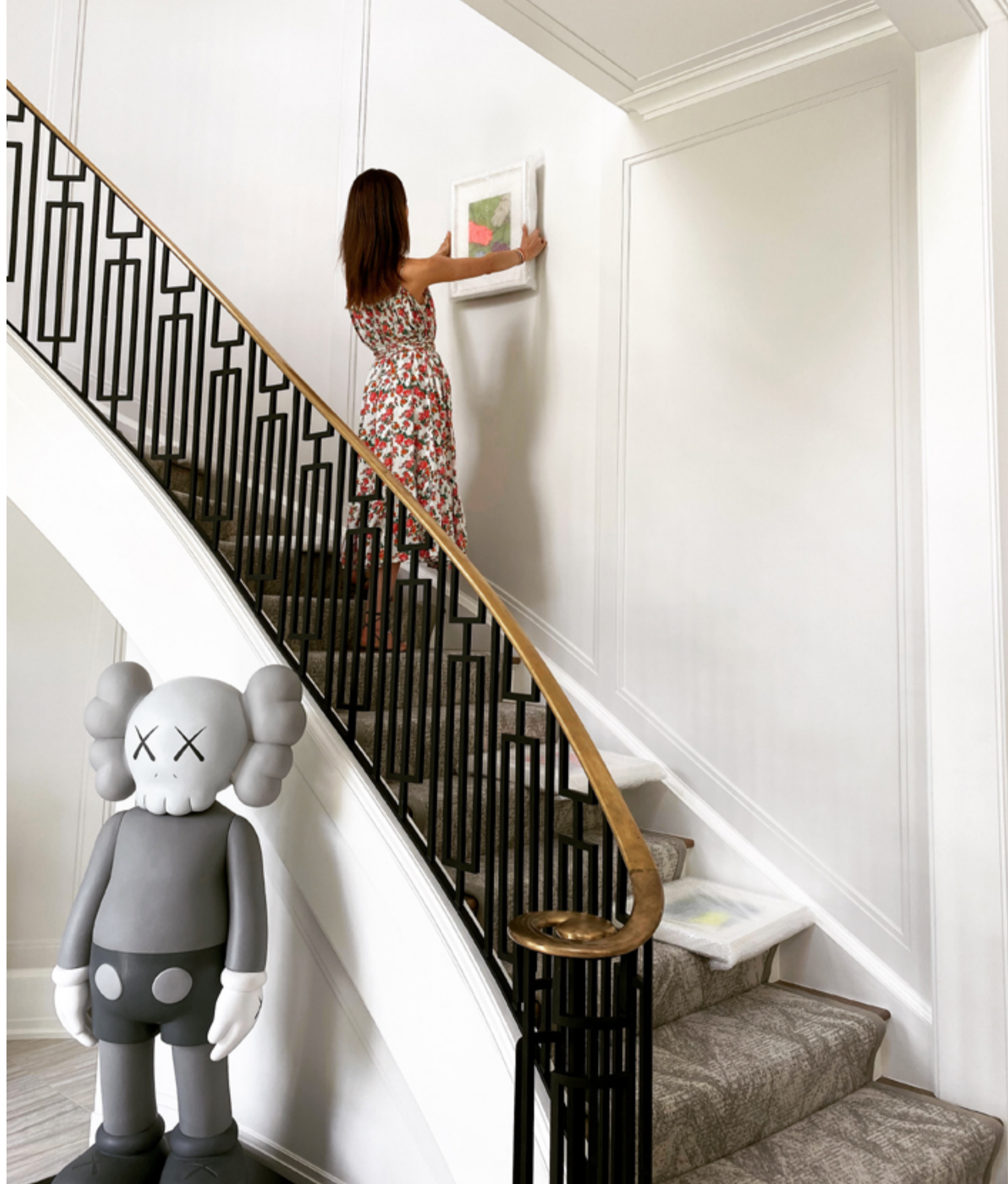
Gabé Hirschowitz curating a gallery wall for KAWS

Beyond planning out the mood of the room where your new purchase will live, it's also a good idea to consider practicalities like dimensions. I recommend applying blue painter's tape to your wall or floor space to mark out exactly how much area a piece will take up—bearing in mind that framing may also be integral. Remember: online photographs can throw any eye off as to the size of a piece, so minding the noted dimensions is critical.