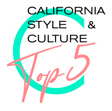
July 1, 2022