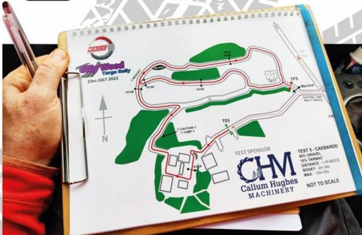
The Cliff Mainwaring Memorial Targa Rally