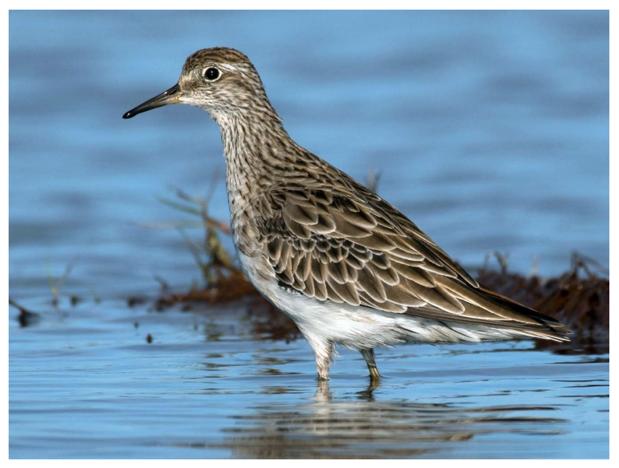
Sharp-tailed Sandpiper (Migratory wetland bird)