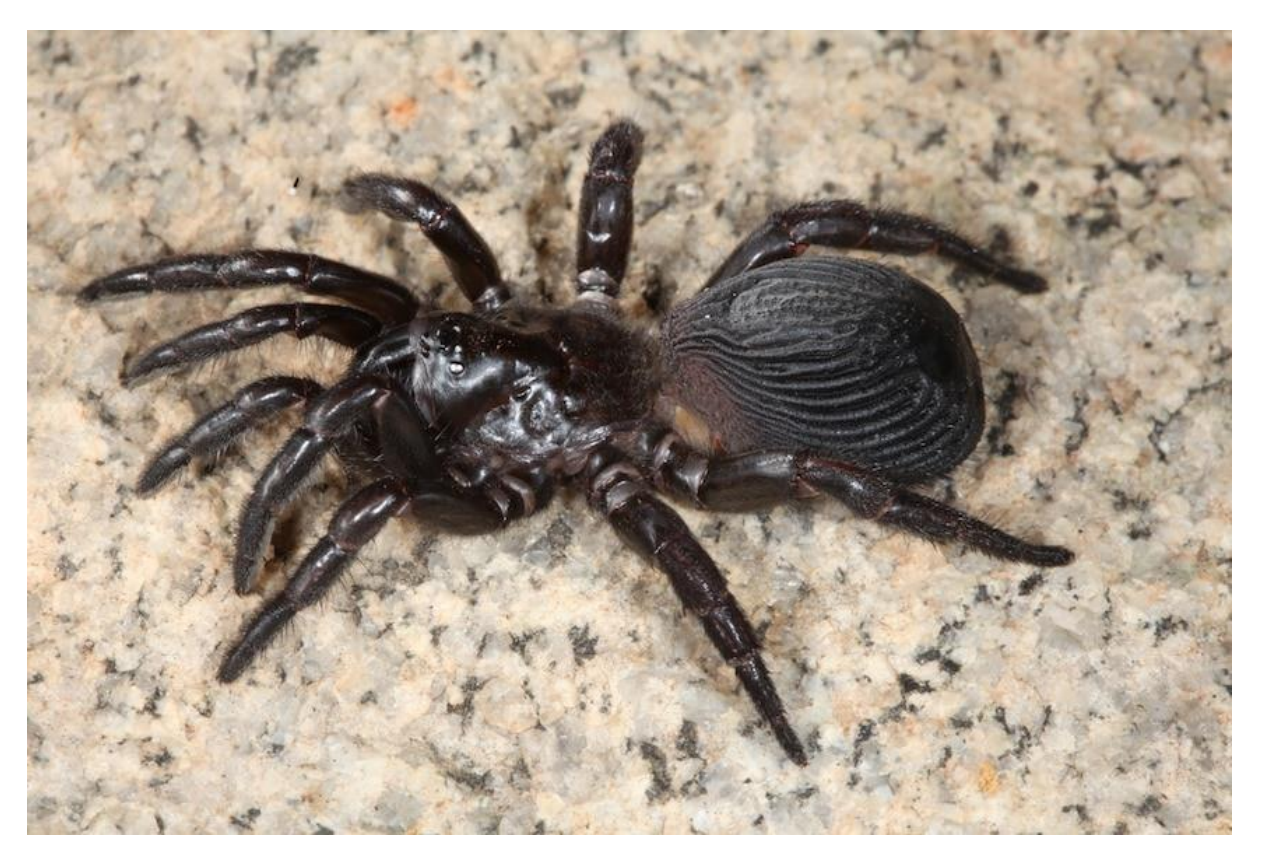
Shield-backed Trapdoor Spider (Vulnerable)