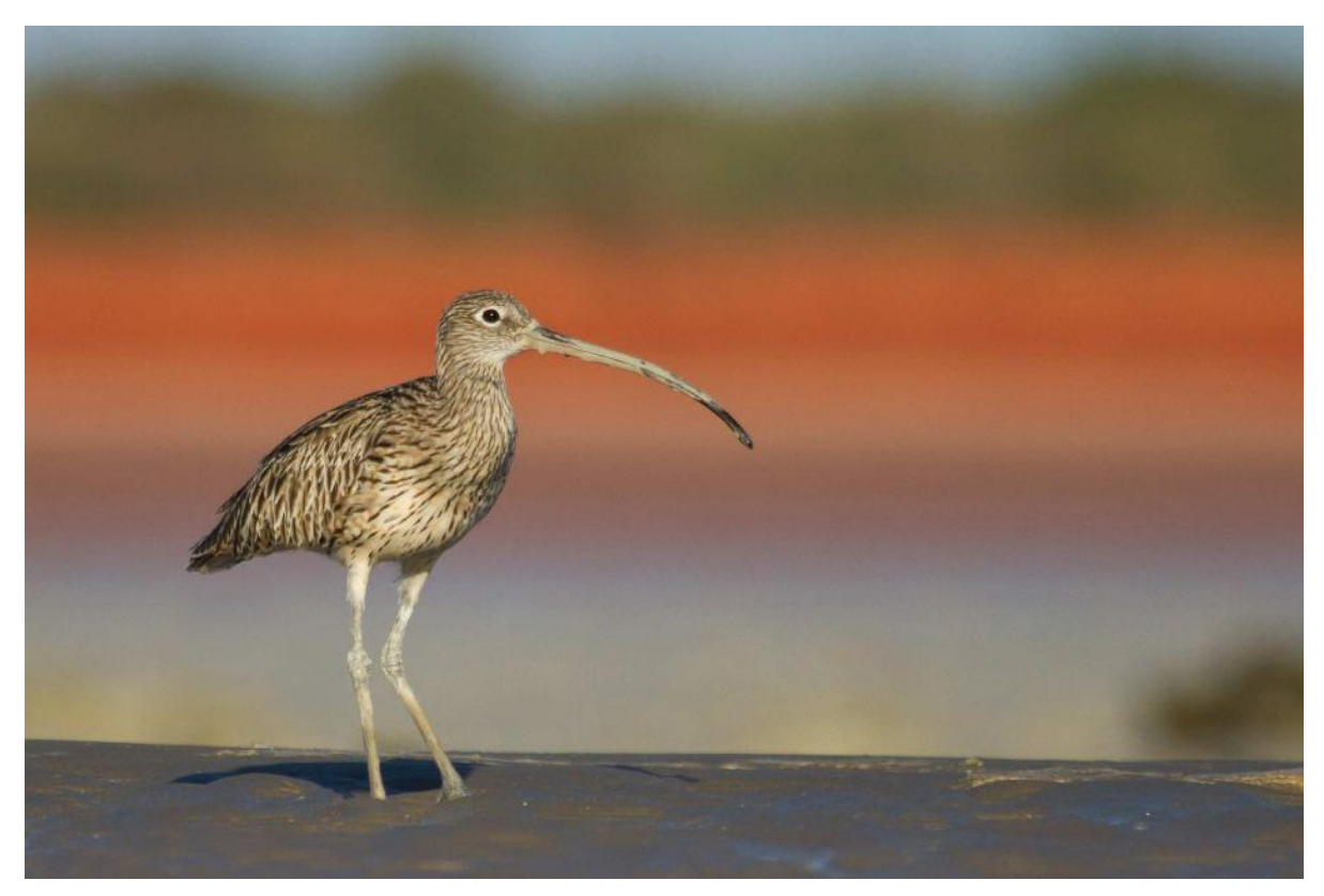
Eastern Curlew (Critically Endangered)