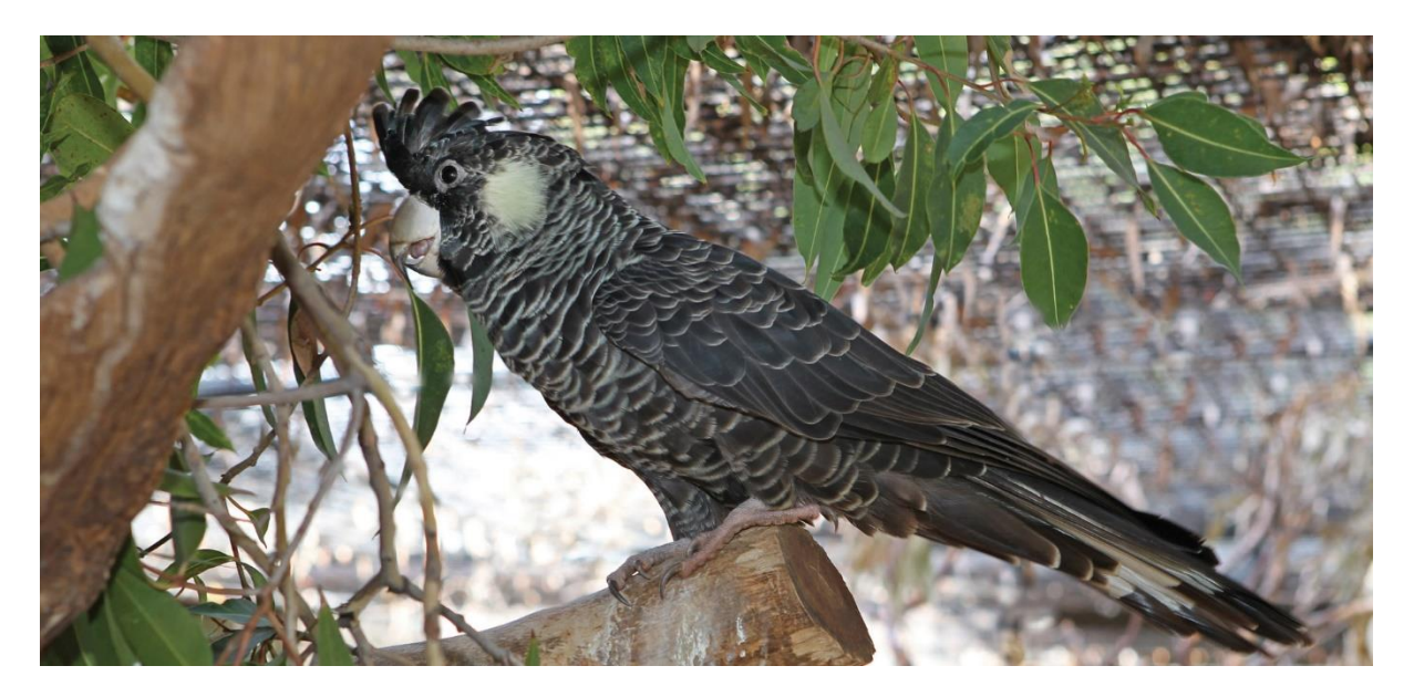
Baudin's Black Cockatoo (Endangered)