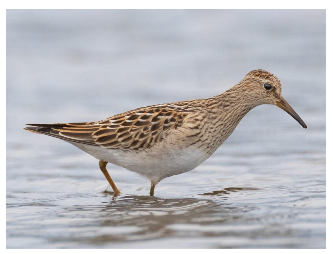
Pectoral Sandpiper (Migratory wetland bird)