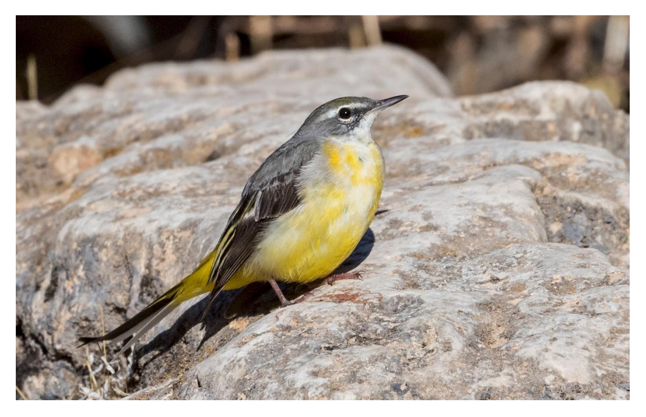
Grey Wagtail (Migratory terrestrial bird)