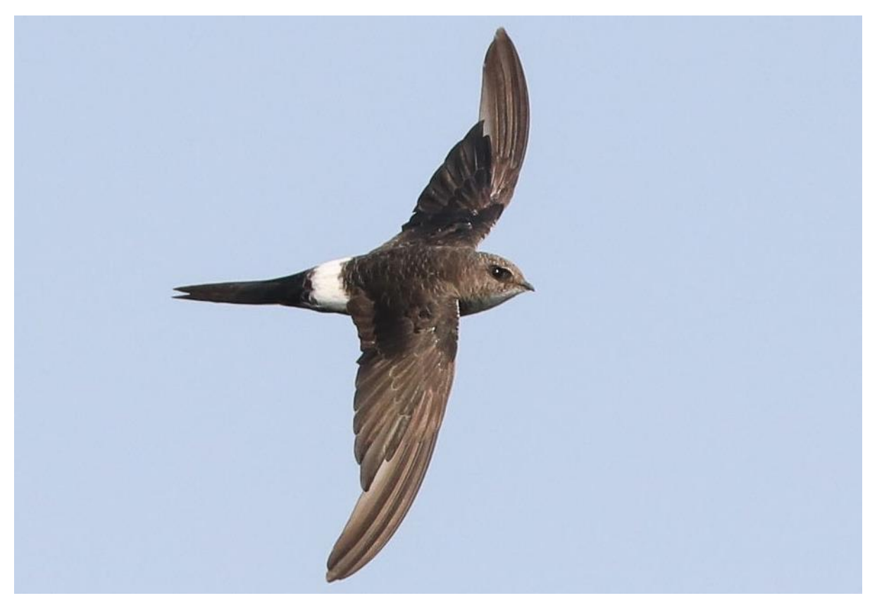
Fork-tailed Swift (Migratory marine bird)