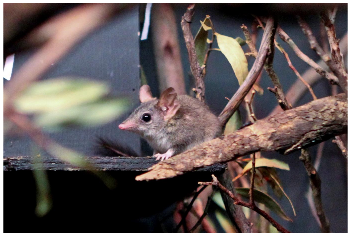
Red-tailed Phascogale (Vulnerable) Nocturnal