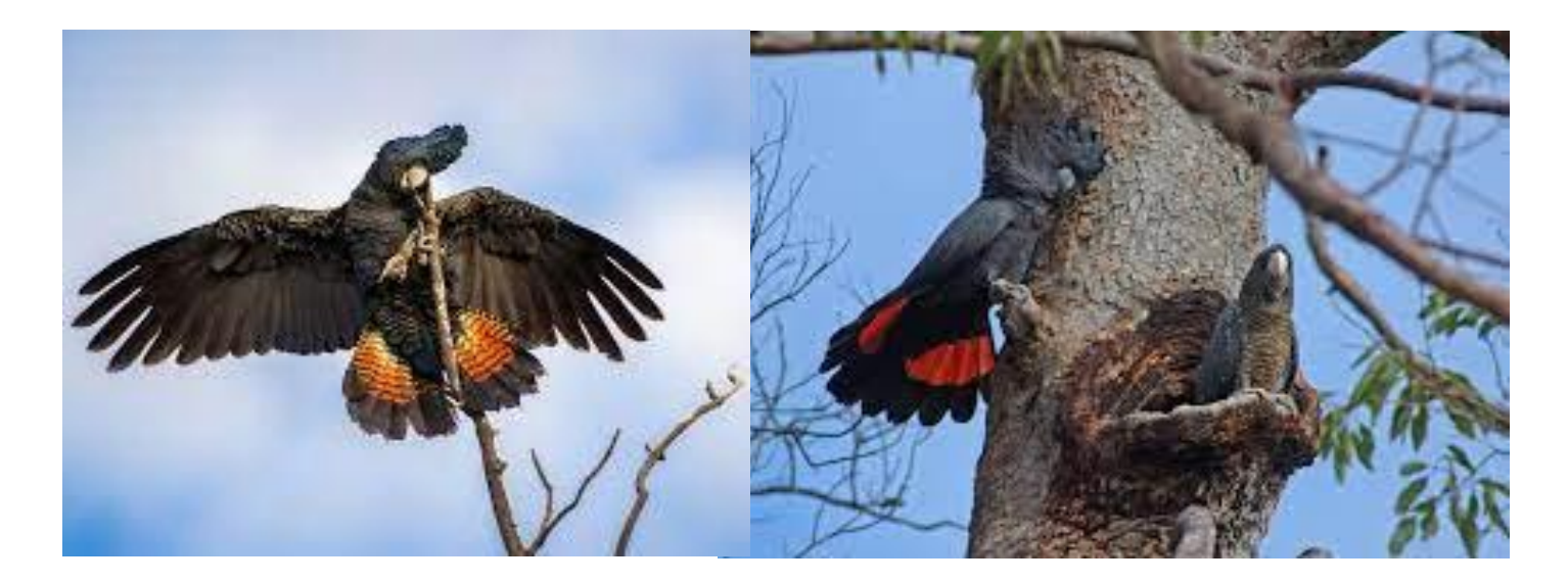
Forest Red-tailed Black Cockatoo (Vulnerable)