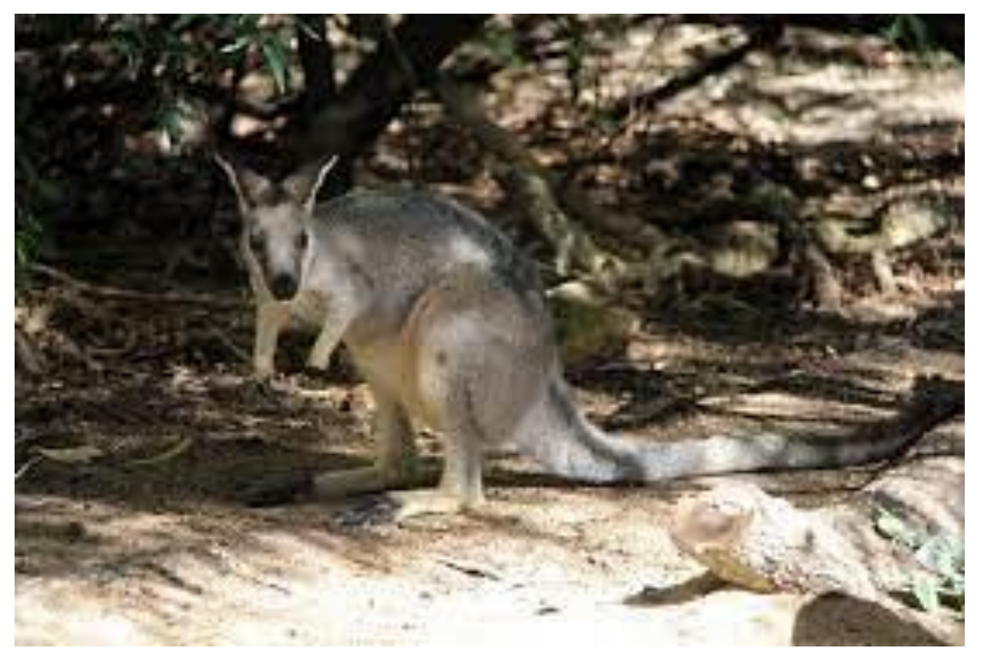
Brush Wallaby (Priority 4 species)