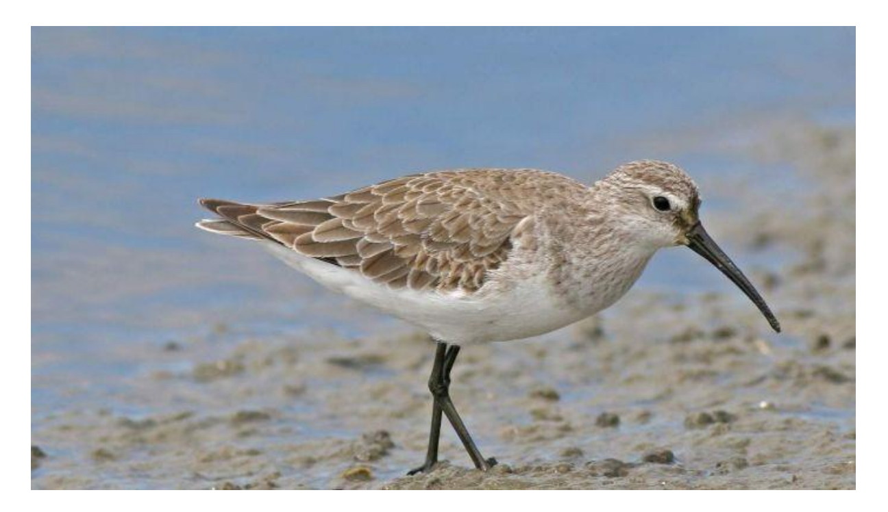
Curlew Sandpiper (Critically endangered)