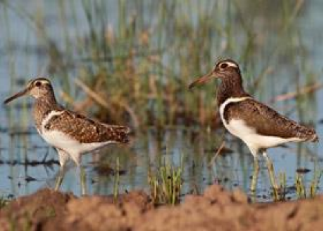
Australian Painted Snipe (Endangered)