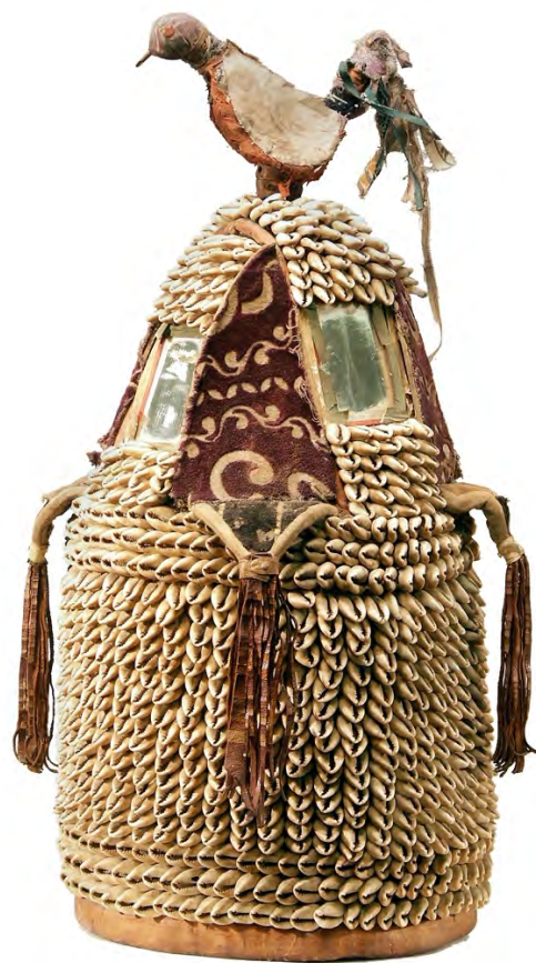
Figure 1: Ile ori (Ibori) .