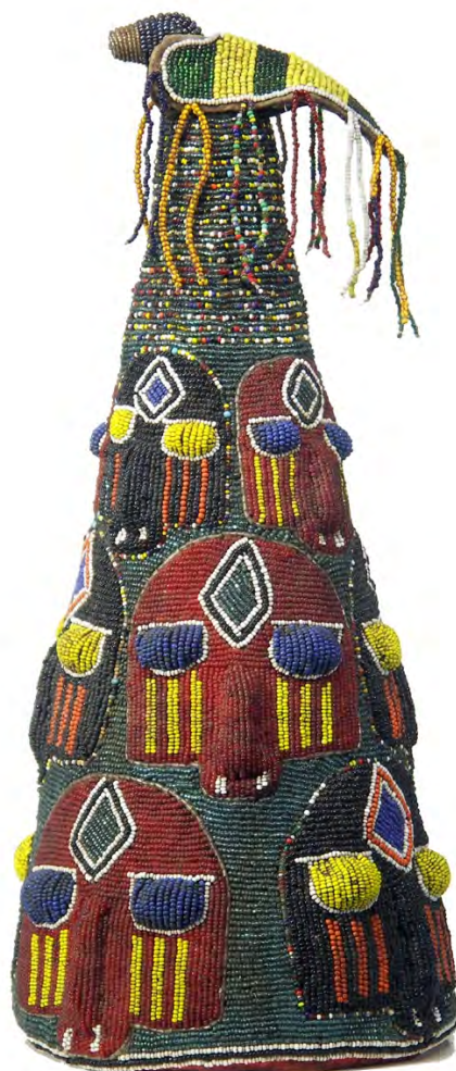
Figure 2: A Yorùbá beaded Crown. Note the conical shape which is most popular among Yoruba beaded crown.

called Adé (crown). The royal crown maker, who is usually a devotee of the orí cult, is also responsible for the making of the Oríkògbófo . He is allowed to freely express his creativity in the making of it , as he is not bound to convention in this endeavour. The conical shape of the Yorùbá beaded crown further sheds light on the issue of head covering. The crowns are purposefully designed to serve as a dwelling for the king's head (see figure 2). In itself, the crown is a representation of the supremacy of the orí deity in abstraction. Thus, the traditionally preferred conical shape, for the Yorùbá beaded crown, is similar in physical form to the “shrine” or house of orí .