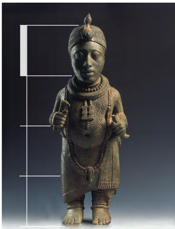
Figure 4: Brass Statue of an Oni of Ife. An example of Ife ancient sculptural Art showing the “African proportion” of approximately ratio 1:4.

Beyond the Ife heads, the general corpus of anthropomorphic images of the Yorùbá in terra cotta or wood like the Ère Ìbejì (ibeji/twin sculpture) or Lamide Fakeye’s works, follow the same proportion formula. In fact, in many cases, the head is much more prominent than the examples from Ife. Ratios of about 1:2 or 1:1 are plentiful. It is important to mention here, that a few scholars have expressed divergent views about the theory in question, however, none have in any way fully disagreed with Fagg’s theory of the enlargement of the head. Blier (2012) argued that the details of this proportion theory slightly vary in Yorùbá sculptural art with the ratio ranging from 1:4 to 1:6 depending on a variety of indices. She concludes however with the fact that the act of exaggerating the orí in Yorùbá traditional sculpture is agreed upon by all.