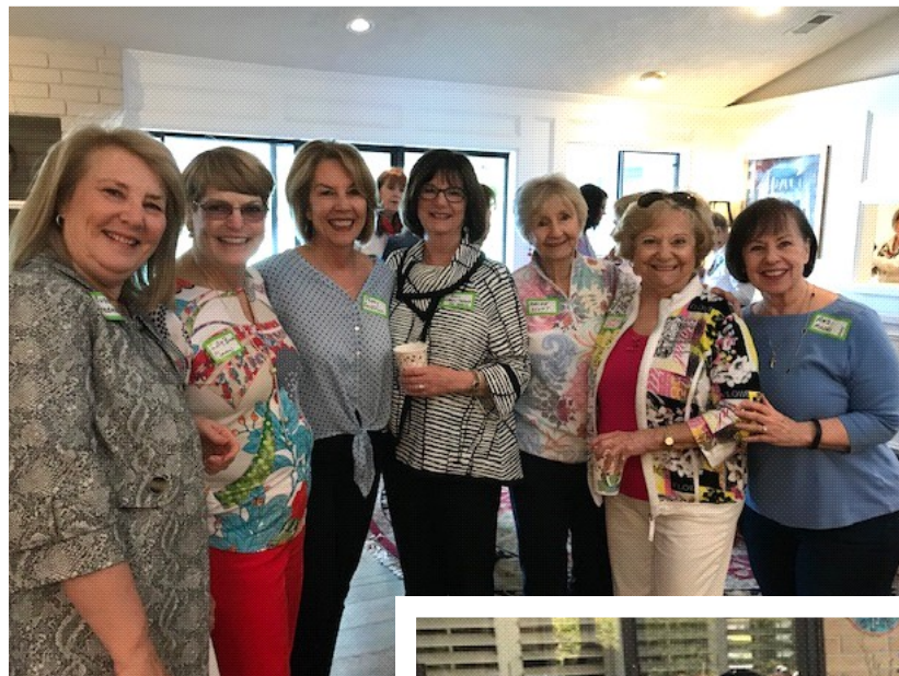
Our residents enjoying The VE Spring Coffee with hosts and neighbors.