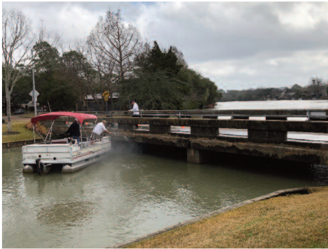
A big thank you to our board members who recently power washed our neighborhood bridge. It has never looked better! Take a walk or drive by to see what it looks like now.

PRSR STD US POSTAGE PAID HOUSTON, TX PERMIT #8327