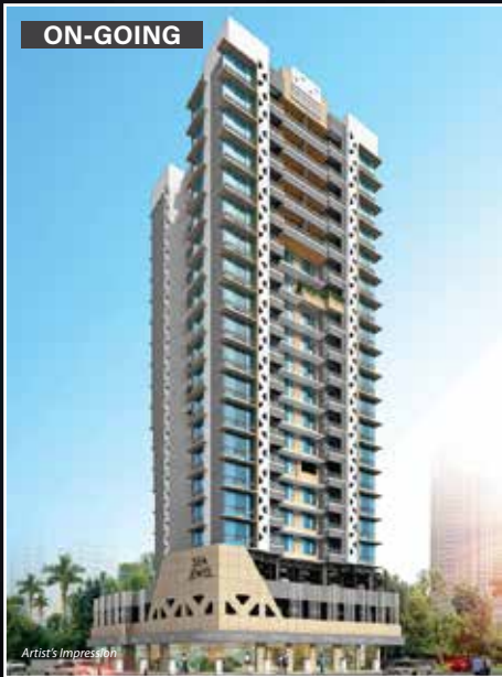
Sea Jewel, Malad (East)