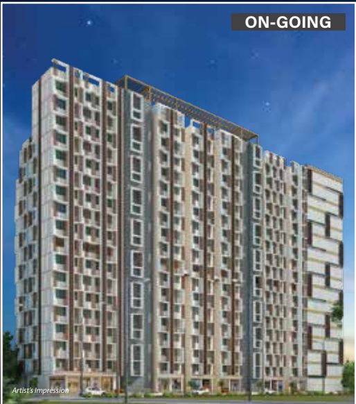
Hubtown Harmony, Matunga East