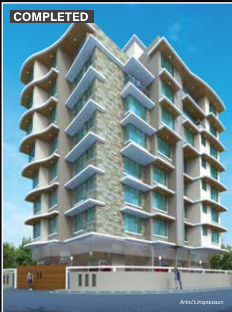
Sudhanshu, Vile Parle (East)