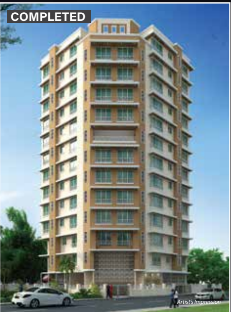
Marshall Horizon, Vile Parle (East)