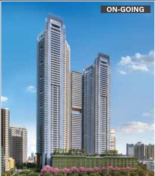
25 South, Prabhadevi