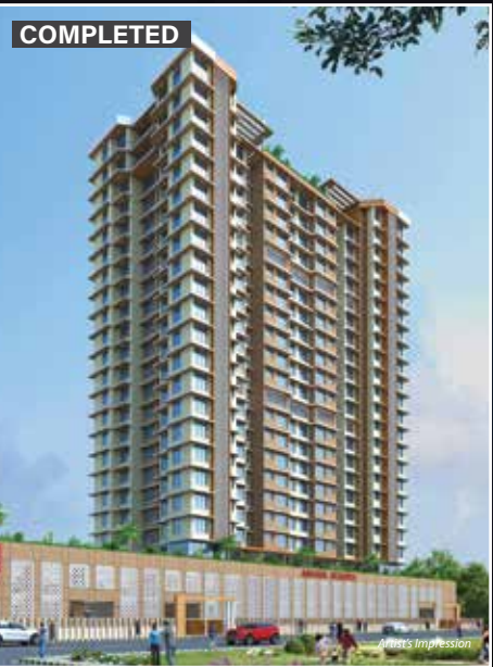
Anshul Heights - A & B Wing, Kandivali (West)