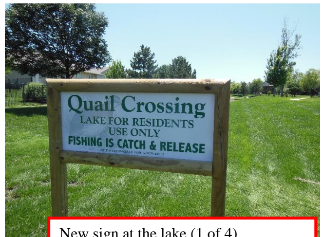
New sign at the lake (1 of 4)

Lake signs are up at the 4 entrances to the lake. While the signs make take time to get used to for residents in close proximity. While the signs may take time to get used to, they are needed to protect our private lake and surrounding grounds from non-resident exploiters. The sign has a quail in the background and emphasizes catch and release of fish. Because our lake is private, no Kansas fishing license is required for fishing. All residents using the lake or any of the our community's grounds are reminded to not leave your trash, food wrappers, drink cups, and fishing paraphernalia on QC property. Tell your kids not use the street drains as trash bins as this all ends up in the lake. This includes free papers