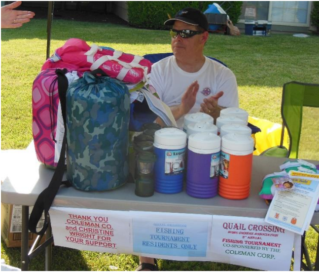
Prizes donated by Coleman-2014