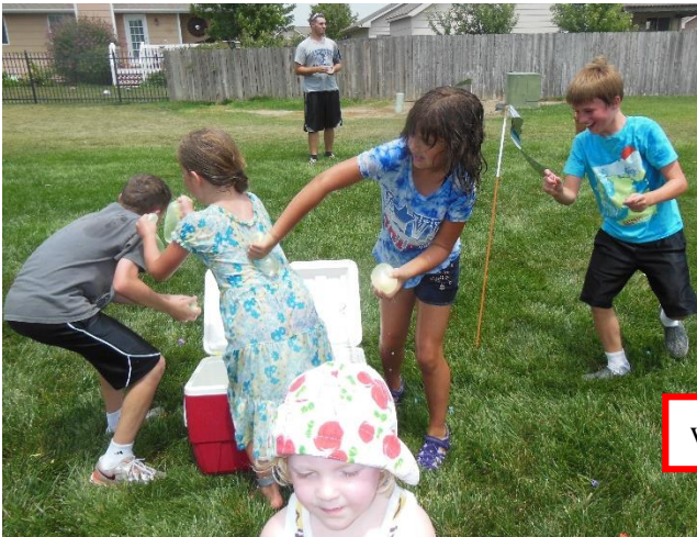
water balloon free-for-all