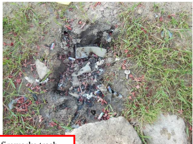
4 th of July fireworks trash carelessly left at the lake