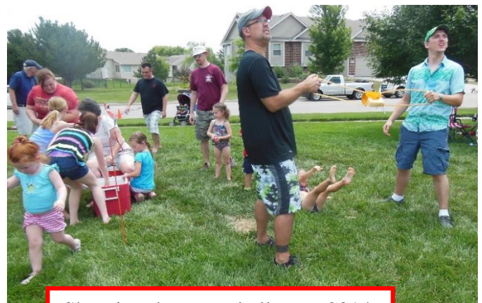
Shooting the water balloons -2014