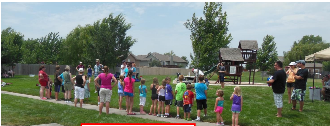
In line for scavenger hunt