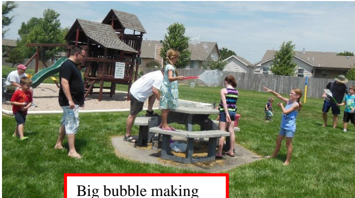
Big bubble making

See additional (different) pictures at our website.