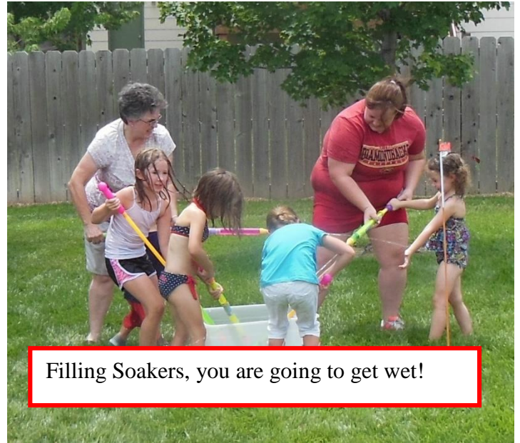
Filling Soakers, you are going to get wet!