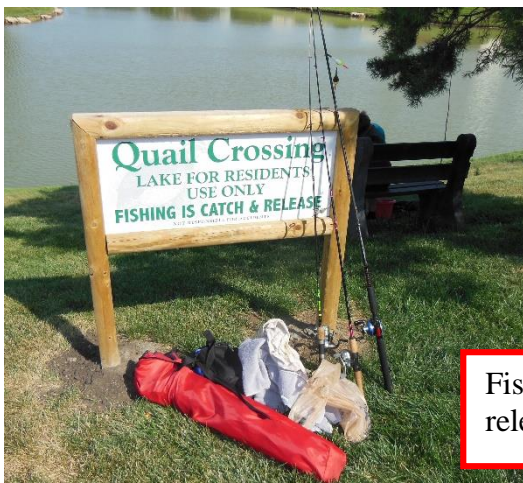
Fish catch and release

Can't stop fishing for sunscreen; Mom, you do it.