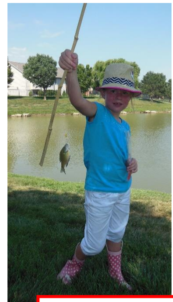
Also pretty small