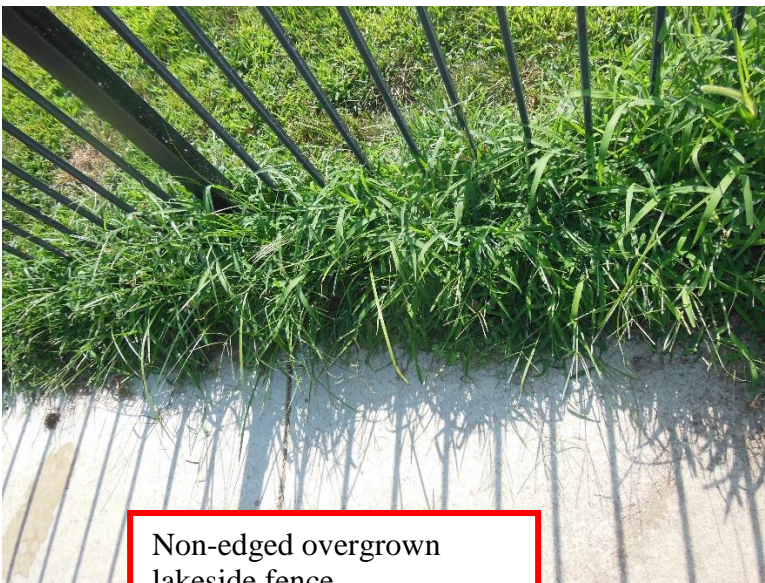
Non-edged overgrown lakeside fence

your property. Contracting pavement filled in with sand and dirt produces a fertile band for weed growth. It just doesn't look good and doesn't take much effort to correct.