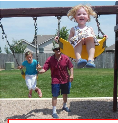
Swinging on the playground