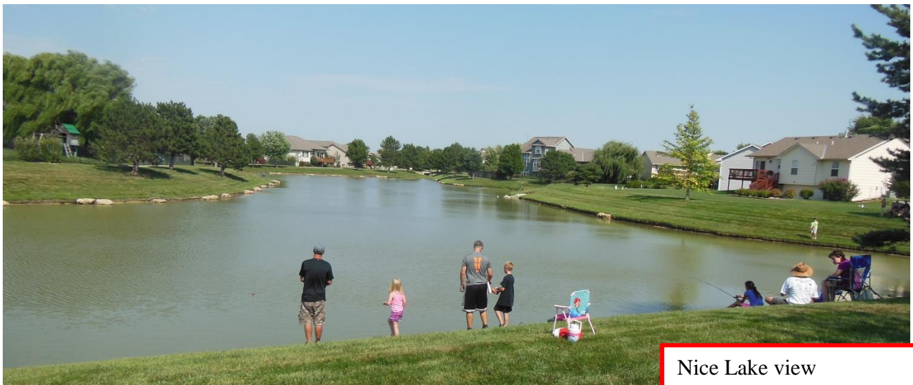
Nice Lake view