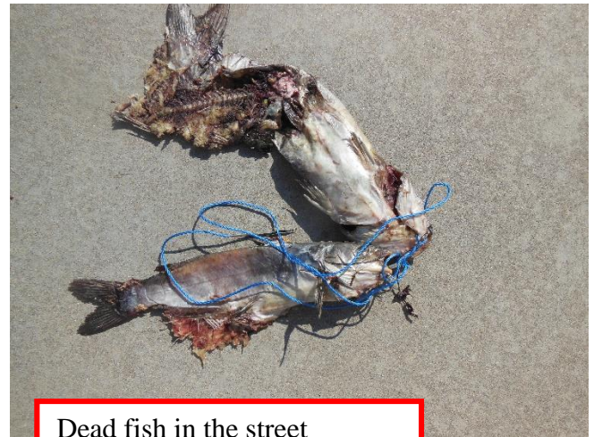
Dead fish in the street

Our new community signs reminding everyone that use of the QC lake is reserved for QC residents and that fishing is catch and release. Recently youth were observed throwing two large catfish from the lake onto a parked car parked on Quail Crossing St. This was the epitome of a stupid and senseless act . The fish slid off the hood of the vehicle and were run over by one or more vehicles. If your kids fish the lake, remind them not to take a stringer , but take a camera to document their great catch. Then return all fish back to the lake to be enjoyed by another fisherman in our community.