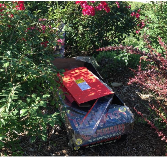
Fireworks trash dumped in the planter of a QC home

If you receive QC's Email alerts, you got a summary of the hours when Andover allows fireworks: While the City allows fireworks until midnight, some think it should be 10pm. People actually would like to sleep after 10pm without earplugs and loud fans to block out those window-rattling fireworks. I'd like to praise most QC residents for cleaning up their fireworks debris rapidly. However, admonishments got to those that dumped their fireworks trash in a neighbors bushes and to those that that used the east side of the lake edge to shoot their fireworks and then left debris for someone else to clean up. Clean up your act and respect your neighbor's and community property.