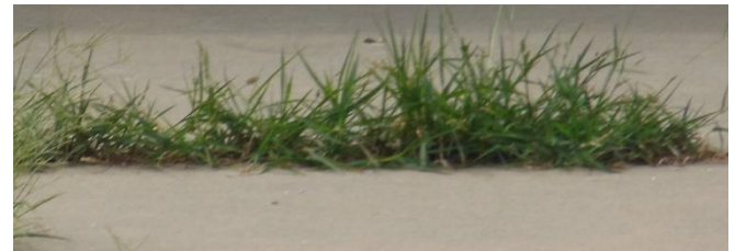
Woolly grass driveway

dormant fescue later in the summer. As in the last newsletter, avoid cutting your grass shorter than 3.5 inches to help retain soil moisture and prevent heat damage. " Woolly Driveways " are pretty common in QC this time of summer. Driveway and sidewalk expansion joints have deteriorated in the community. This give and opening for grass to grow in your cracks. This condition makes your property look ragged and poorly kept. A permanent solution is to spray them with Roundup to kill the roots, weed whack them to clean out the cracks and then seal the cracks with a latex based driveway crack sealer to prevent future incursions.