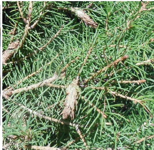
Bag worms eating