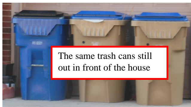
The same trash cans still out in front of the house

Six-months after of covenant changes that require homeowners to store their trash cans out of sight (not in front of the house or garage), some QC members continue to leave them parked in front of the house/garage. Doing so give the impression that you care more about your trash than an attractive abode. Trashy is not be how QC should be viewed. Please store them at the side of the house, in the garage, behind the house/fence or behind a fence screen. The covenant in part states: “ Trash must be collected regularly with cans put out only immediately before pick up day and stored at all other times so as not to be seen in front of the home or garage. ”