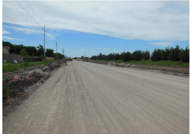
Road base prepared for paving south of QC's 159 th St. entrance