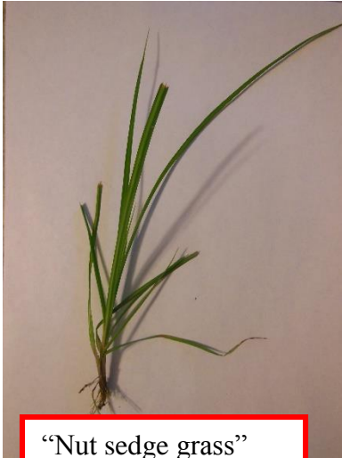
"Nut sedge grass"

yard, Bayer's Bermuda Control for lawn is smelly stuff, but does a pretty good job of killing these unwanted grasses without hurting your fescue. As with all lawn chemicals, you should wear protective gloves and wear a mask if you are generating much aerosol. Stay up-wind while spraying to prevent contact with the spray. The other weed is Nut Sedge that characteristically has 3-4 long shoots above the rest of the grass. These can be sprayed or pulled when the soil is moist.