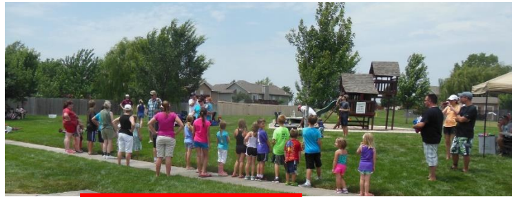
QC Funday 2014

Quail Crossing HOA will host the 4 th summer funday for QC residents at the playground commons area. As in prior years, there will be a picnic at noon, and at 1:30 pm games for kids that involve water balloons, bubbles, and a scavenger hunt. There will be a fishing tournament with prizes in the afternoon 3:30 to 5:00. Here is a picture from last year.