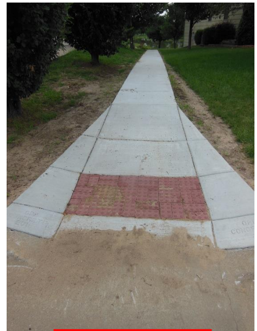
New sidewalk west side to lake

There was board discussion and a vote to repair the crumbling west walkway to the lake from Quail Crossing St. The ramp from the street had failed and several sections had buckled from tree roots. This project was completed at a cost of about $3,000 (see picture-right). The board considered whether it would be an opportune time to electrify the west entrance to provide a receptacle and LED lighting for the QC west entrance monument while the 159 th St. is being widened. The board tabled the project until the 159 th widening is completed.