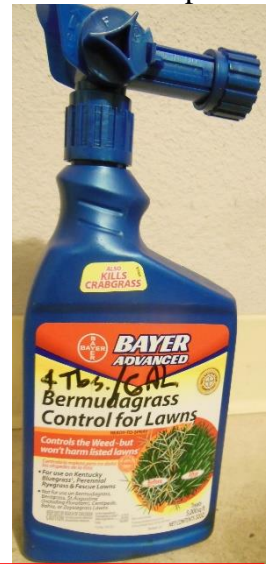
Bayer Bermuda Control For Lawns

This is when weeds get an opening to sprout and outcompete your semi-