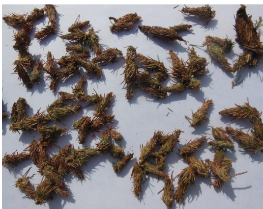
Squashed Bagworms – just a few of many

evergreens. If you spray them with insecticide it will probably take several applications over days to kill them all. If you want to avoid toxic sprays, put on some blue nitrile gloves and start squishing them. Expect to repeat the process four or five times to get them under control.