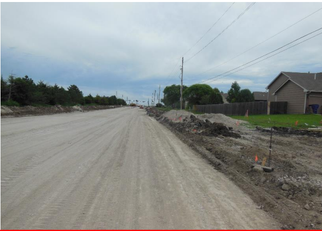
Looking north toward 21 st St. where concrete paving has commenced