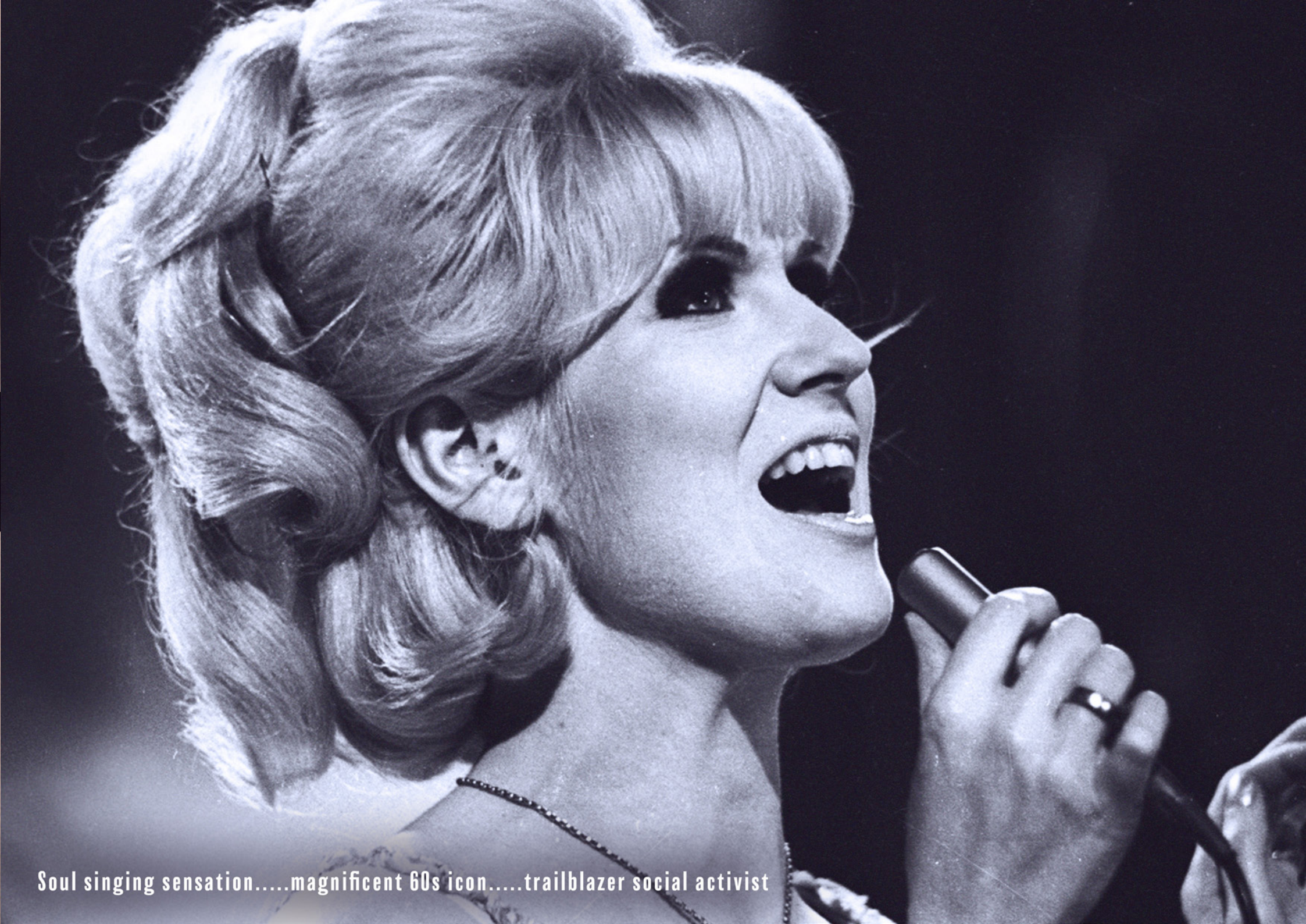
Soul singing sensation.....magnificent 60s icon.....trailblazer social activist