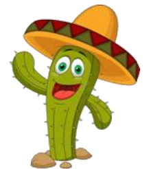
Cactus Charlie says, “See you at the show!”

PAC Patron memberships and complimentary show tickets are now managed in the new ticketing system. Membership packets and paper vouchers are no longer issued. Upon enrollment, you will receive an email from the Westbrook Village Performing Arts Council confirming your membership level and details for redeeming your complimentary show tickets. When purchasing your complimentary tickets online, enter your PAC Patron membership level name (Cholla, Ocotillo, Agave, PricklyPear or Saguaro) in the PAC Patron Level Code box during checkout. When calling the Box Office to order your tickets during the performing arts season (October-April), request your complimentary tickets at time of purchase.