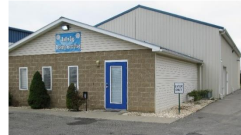
Butler Dog Training Facility

Butler Veterinary Associates & Emergency Center , 1761 N. Main St. Extension, Butler, PA 16001 (724)283-2345 – 4 miles from show site, 8 AM to 12:00 AM *May have limited availability*