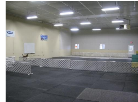
Ring set up 40' x 50' Ring with gating ¾ inch rubber matting