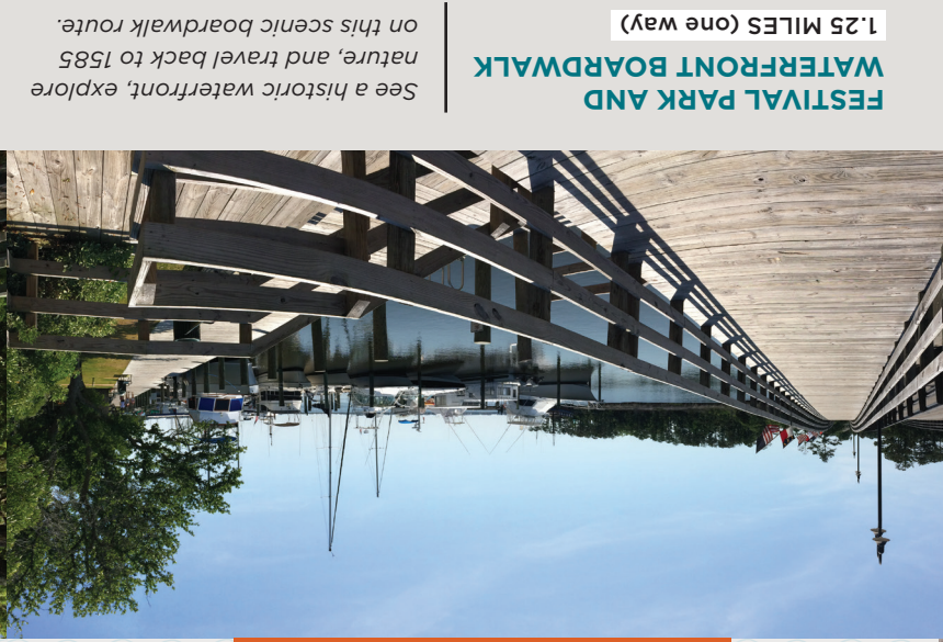
FESTIVAL PARK AND WATERFRONT BOARDWALK 1.25 MILES (one way) See a historic waterfront, explore nature, and travel back to 1585 on this scenic boardwalk route.

WELCOME TO MANTEO AND ROANOKE ISLAND, NC Roanoke Island lies between the North Carolina mainland and its barrier islands, the Outer Banks. The heart of the island is the Town of Manteo's walkable historic downtown, with blocks of unique shops and restaurants, all bordered by beautiful waterfront views. Key historical attractions of the island include Roanoke Island Festival Park, the Outer Banks History Center, Fort Raleigh, and the Elizabethan Gardens, to name but a few. This map features walking and bicycling routes that connect these and other destinations in the Town of Manteo and the north end of Roanoke Island.