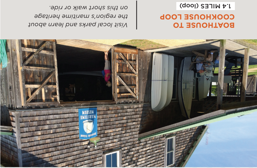
BOATHOUSE TO COOKHOUSE LOOP 1.4 MILES (loop) Visit local parks and learn about the region's maritime heritage on this short walk or ride.

This boardwalk route connects natural maritime forest with Manteo's historic waterfront marina. It features Roanoke Island Festival Park, a 25-acre interactive historic site, with attractions celebrating the first English settlement in America and the Algonquin culture that preceded it. Be sure to visit the Outer Banks History Center, featuring regional archives of coastal North Carolina's history and culture. The route also features Manteo's Waterfront Marina, with a scenic boardwalk connecting to the Roanoke Marshes Lighthouse and the Roanoke Island Maritime History Museum. Off the boardwalk from the marina are small shops, cafes, galleries, and restaurants to visit along the way.