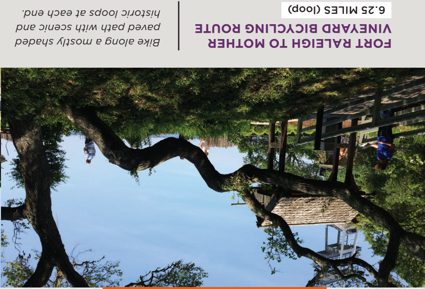
FORT RALEIGH TO MOTHER VINEYARD BICYCLING ROUTE 6.25 MILES (loop) Bike along a mostly shaded paved path with scenic and historic loops at each end.