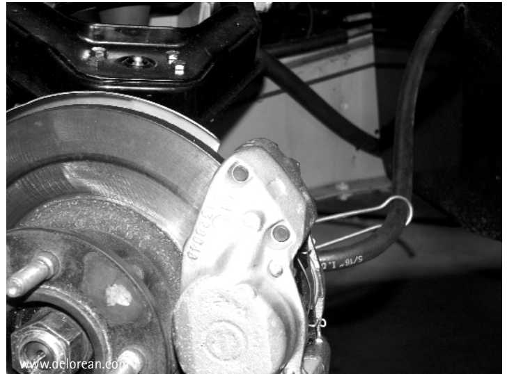
Figure C - Notice the speedo cable that has been fed through the bracket on the right. This is the proper positioning after threading.

12. To test your newly installed angle drive leave the front wheel jacked up and spin the wheel fairly quickly and have a friend or partner check to see if your speedometer is moving. If the speedometer moves, your installation was done correctly. If however it does not move, check all speedo cable connections, the dust shield installation and movement of the angle drive. 🚗