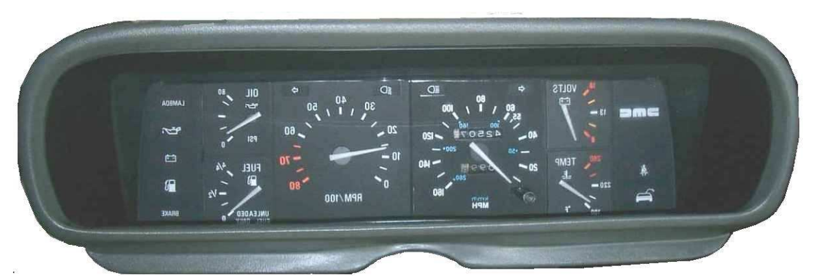
NOTE! Binacle has been mirrored to make it easier comparable to the picture below

Delorean Binacle / Cluster 25.03.05 Elvis & 6548