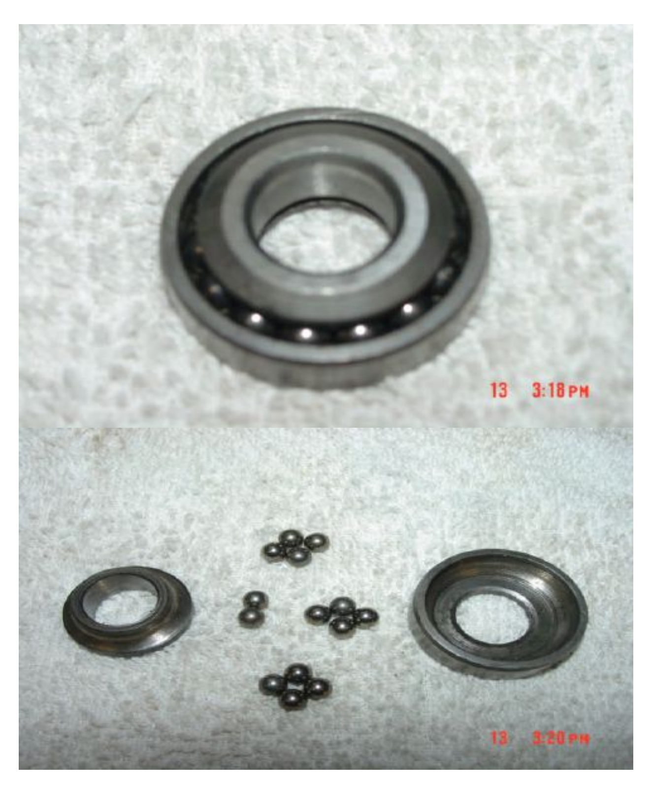
Step #5---Clean all parts and replace any that are bad. Note: The pinion, the bearings, and the steering rod are made of hardened steel, so they very seldom are bad. There is just not enough force or pressure on them to override the hardness of the