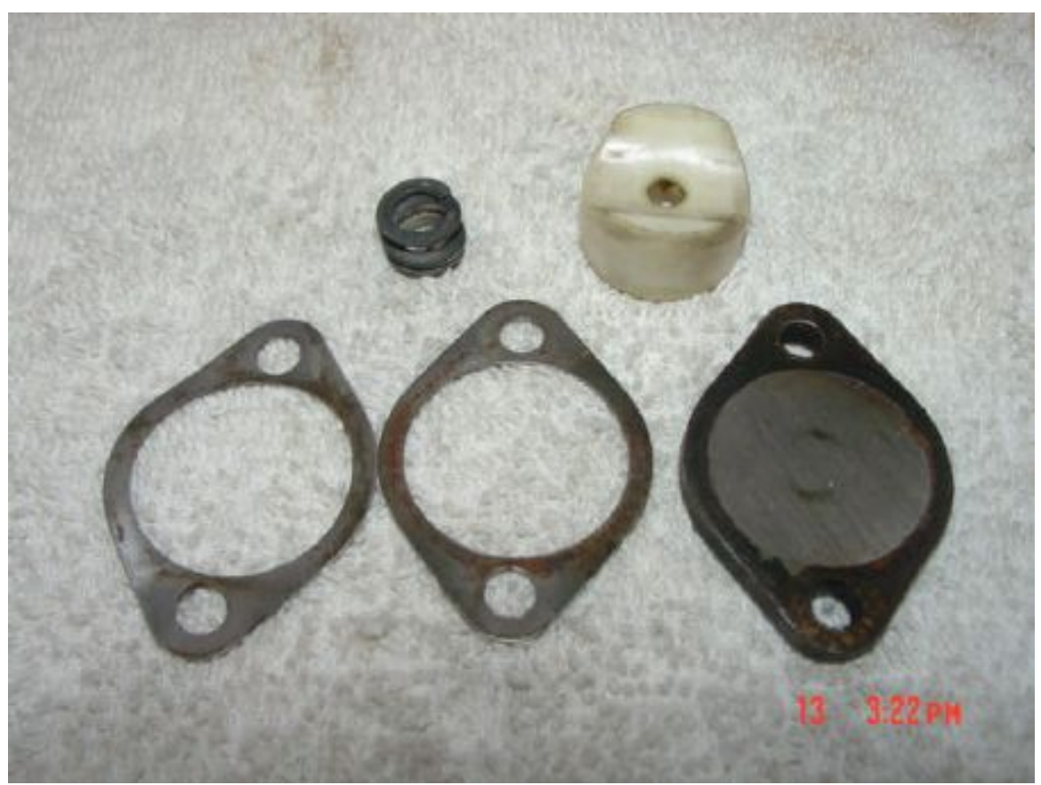
Remove these carefully.

Next, remove the two bolts holding the pinion plate, remove the plate (careful no to damage the rubber bushing in the center, and the shims (mine had three),