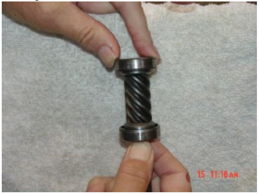
Now, still holding the pinion upside down, slide the bearings

Then, slide the lower bearing on the pinion and let gravity hold it in place.