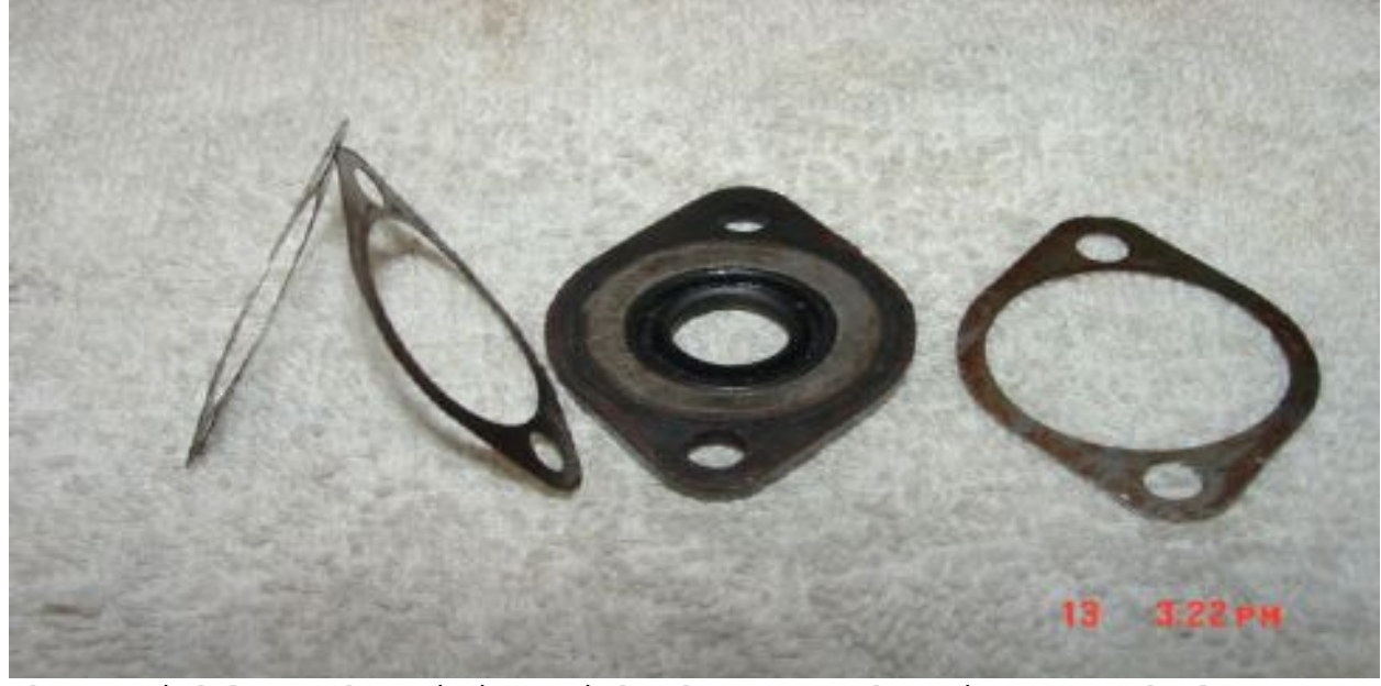
then, withdraw the pinion with the upper bearing attached.

Next, remove the two bolts holding the pinion plate, remove the plate (careful no to damage the rubber bushing in the center, and the shims (mine had three),