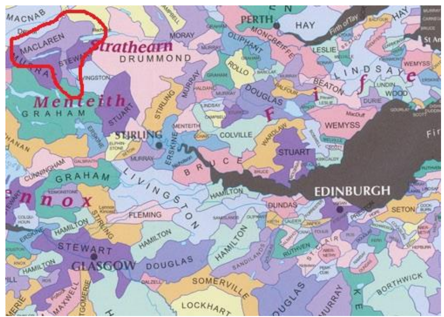
https://www.mapsbookstravelguides.com.au/upimages/International_Maps/Collins/scotland_of_old _collins_sample.jpg (edited)