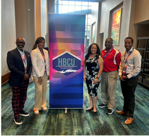
Members of the Greater Washington Chapter volunteered in support of the 2024 HBCU Symposium, hosted by Delaware State University