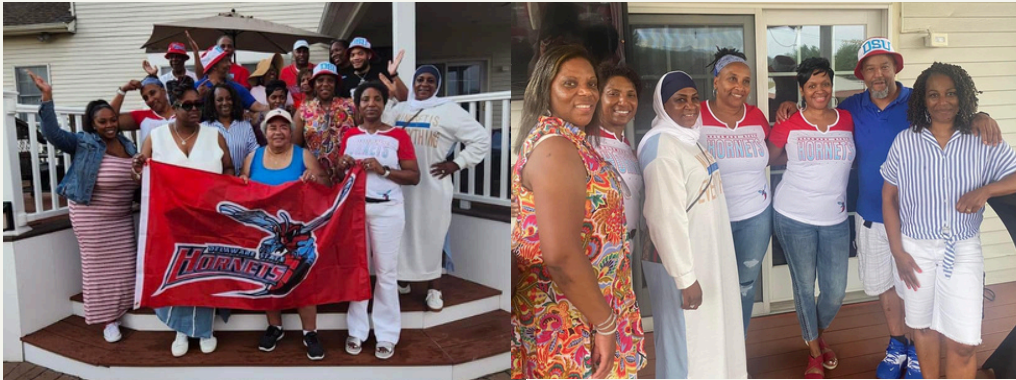
The DSUAA Greater New Jersey Chapter gathered for a Summer BBQ at the Dey's residence.