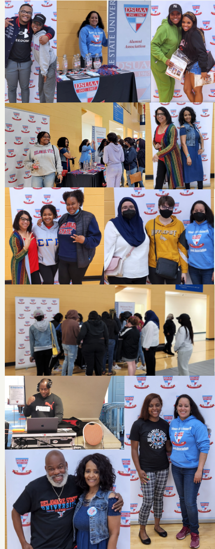
DSUAA engaged with the soon-to-be graduates at the Class of 2022 Senior Send-off on Friday, May 13th.