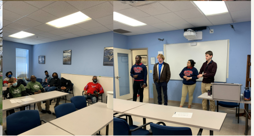
Delaware Airpark: DSU Dept. of Aviation student aviators/ staff provided a presentation of the program, gave a tour of the facility, performed short discovery flights for 4 students and 1 chaperone. A photo in the aircraft hanger. These students were very professional and impressive during our visit! The dept. and administrators are to be commendable!