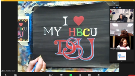
Thank you to everyone who supported the DSUAA Paint Nite. Such a fun and relaxing experience with fellow Hornets!