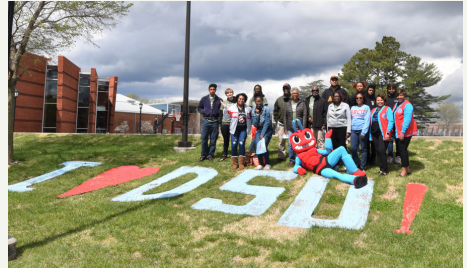
On April 9th, the Greater Hampton Roads Chapter brought several students to participate in DSU's Spring Open House and Campus Tour.