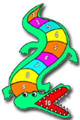
Numbered Crocodile 9 ft long