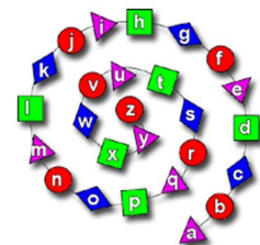
Alphabet Spiral 10 ft dia.