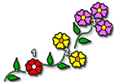
Quantifying Flower Trail Varies in Size