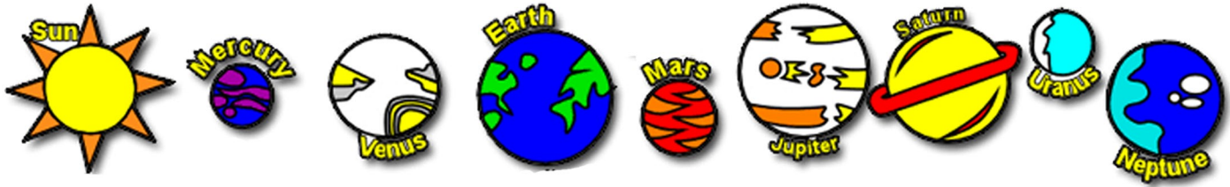
The Planetary System Varies in Size