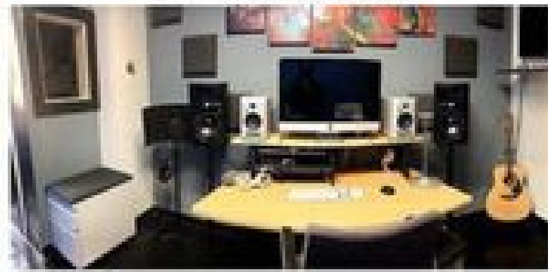
9 Central st lowell, ma

SIGN UP FOR A VOCAL, DANCE, OR THEATER CLASS WITH DRAMATICALLY INCORRECT TODAY