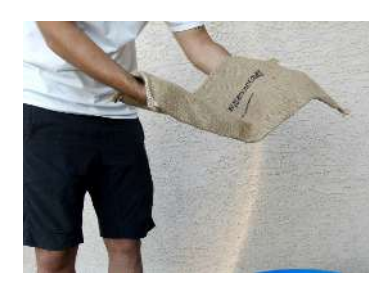
Flat & Lightweight