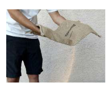
Initially compact & lightweight.

Each unit of QUIK-RESPONSE contains an eco-friendly polymer that grows in both size and mass when exposed to water. This eliminates the need to manually fill each bag with sand. This capability allows Quik-Response to be light and compact during transportation, yet heavy and substantial when activated.