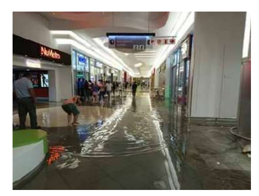
Indoor Flood Protection

Industrial area flooding, manufacturing plants, power plants, warehouses. Office buildings, retail businesses, malls, construction sites. Hotels, hospitals, educational institutions, churches, retirement homes