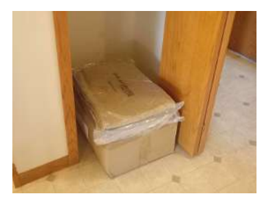
Convenient to Store.

Store Quik-Response in a closet, small shed, or vehicle (equivalent to thousands of pounds of sand).