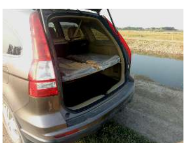
Easy to Transport.

Store Quik-Response in a closet, small shed, or vehicle (equivalent to thousands of pounds of sand).