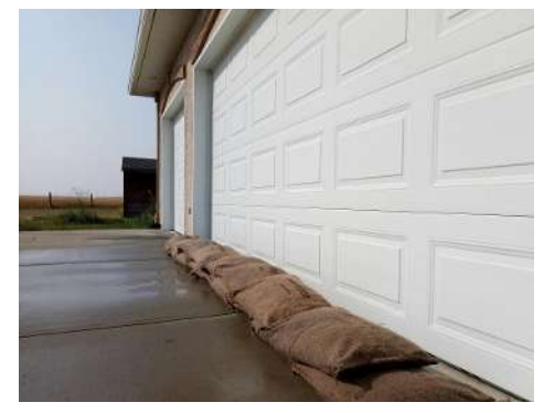
Residential Flood Protection