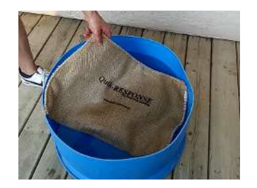
2. Expose to water for 3-5 minutes.