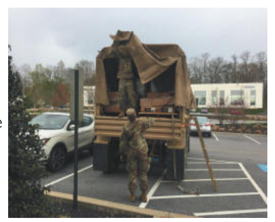
We also received over 1,400 free FEMA shelf stable meals this spring to give to those most in need. For up to date info on help from CCDAS, visit: chesco.org/aging .

Each year, our Chester County Commissioners approve funds for Meals on Wheels which come through the Chester County Department of Aging Services (CCDAS). We are very grateful for their support which covers a significant portion of our administrative expenses. This means that donations from generous supporters and most grants go directly to the purchase of food for our clients who struggle financially.