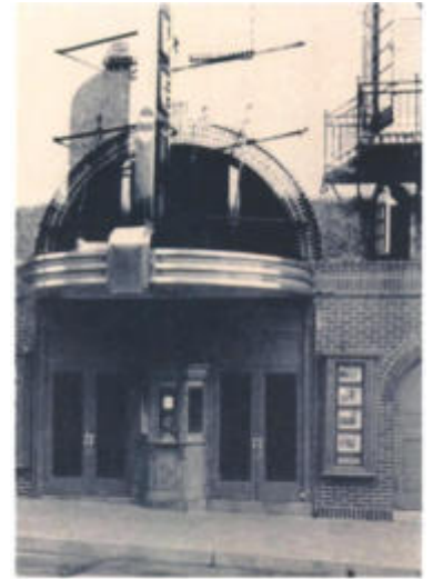
Penn Theater, Royersford, Pennsylvania