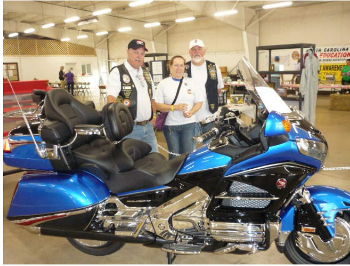
Wishing & hoping all for naught!