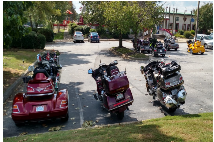
Nice turnout for the after gathering lunch ride to Joe's Crab Shack—11 bikes!