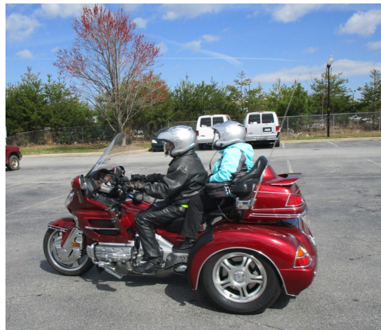
Lunch Ride to Mutt's BBQ in Easley, SC