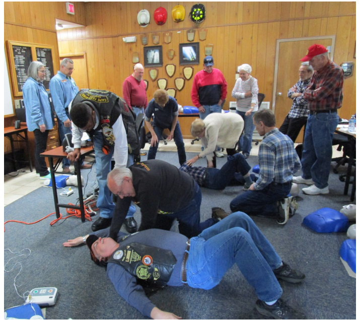
Nice turn out for the CPR/First Aid Class