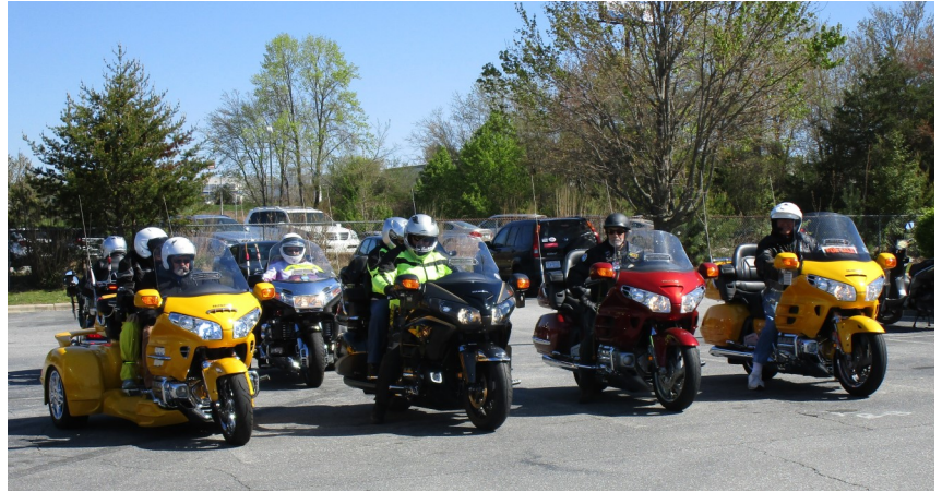
And they're off!