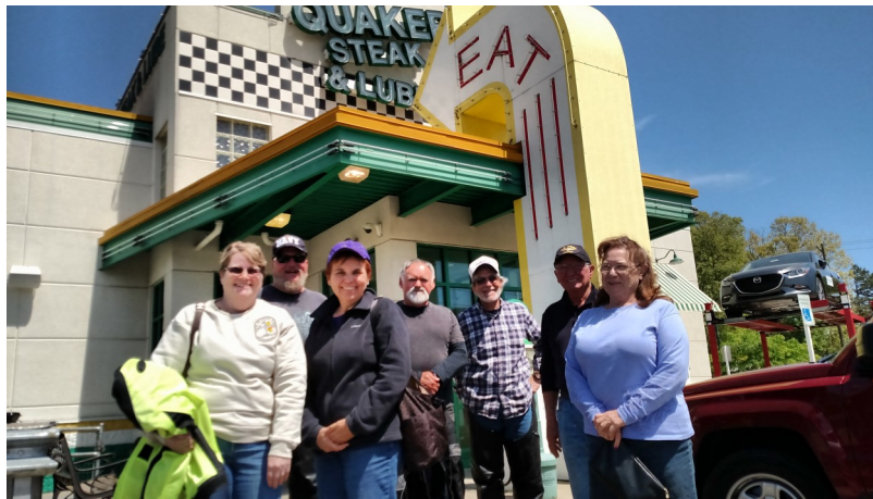
To the Left: Quaker Steak & Lube lunch Ride after the Gather-