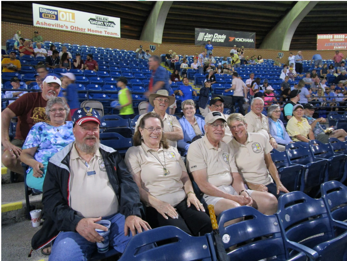
Everyone had a GREAT time at the baseball game! Rained before we got there but we stayed dry! Free dogs & soda for seniors & great seats. And we had real dogs there to entertain us as it was “Bring Your Dogs to the Ballpark Night”!