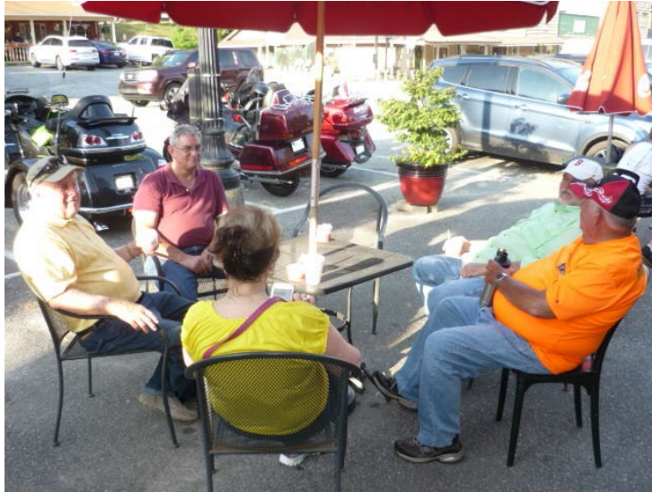
Ice Cream Ride to Chimney Rock to kick off the July 4th weekend!

Also visit our Facebook site: Hendersonville Goldwings-Chapter M2 . Everyone can post pictures & comments there.