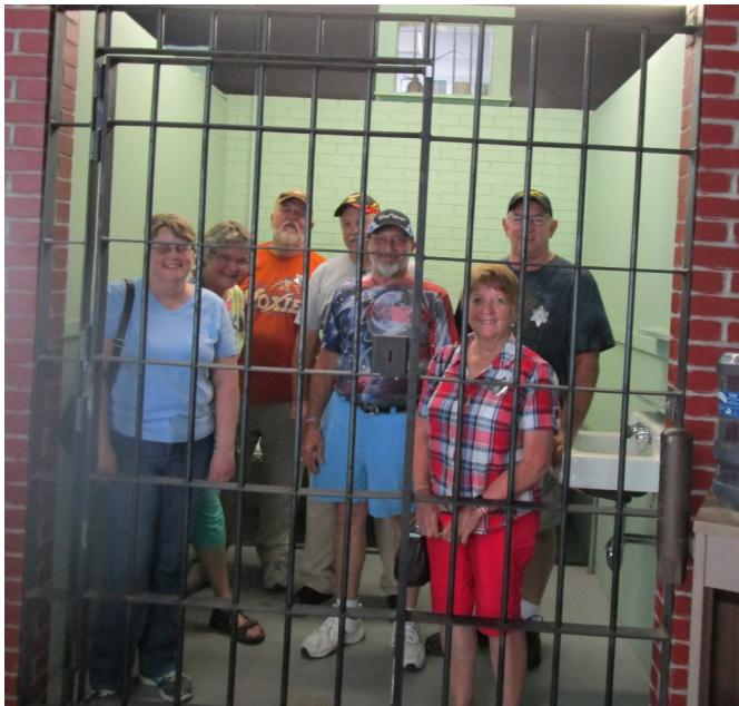
Oh no, who has the key?????????