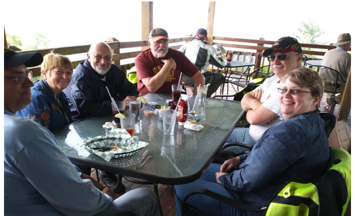
Lunch at Mountain View Restaurant. We could see some too!