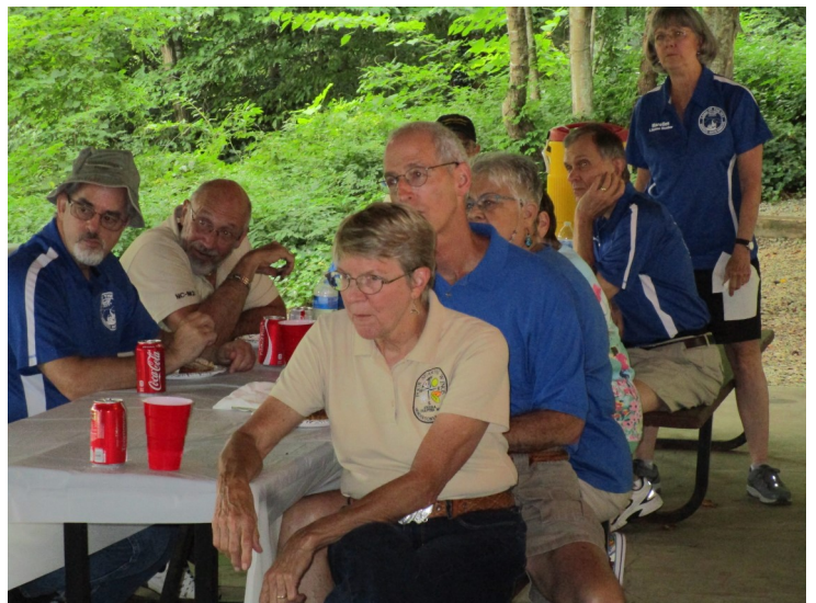
Wonder if there is still some dessert left?