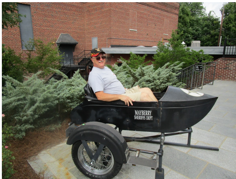
No words needed! LOL

If you're a Road Captain, we need you to help out with some of the planned rides. I will be able to handle most of the rides but not all of them. Want to help out? Pick a ride or two listed on the schedule and offer to organize and lead them. Remember this is our Chapter, not just mine.