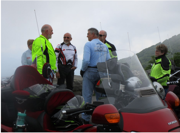
Really, there are mtns out there in the fog?