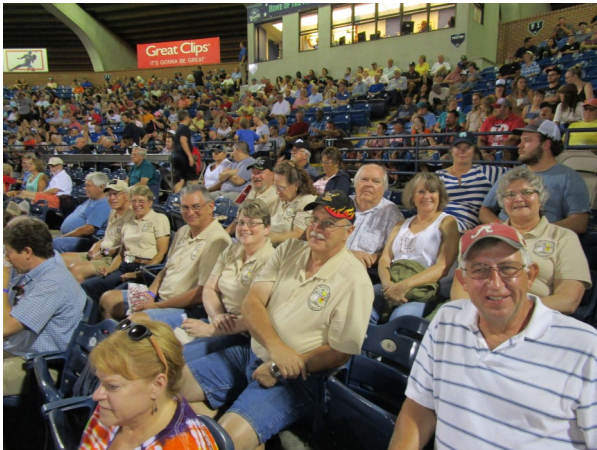
Great time at the Touists game & they won this one!