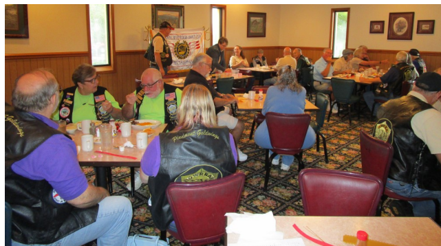
Lot of visitors at our Gathering!