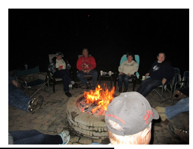
Fall bonfire on a chilly night. Fun time with friends!